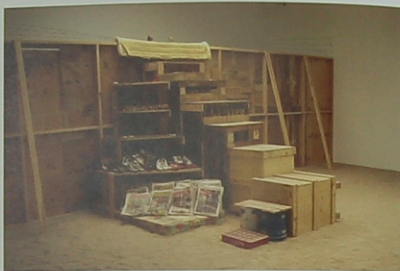
ABOVE TOP: Moris, Hermoso Paisaje 4 (CP) , 2007. Mixed media.