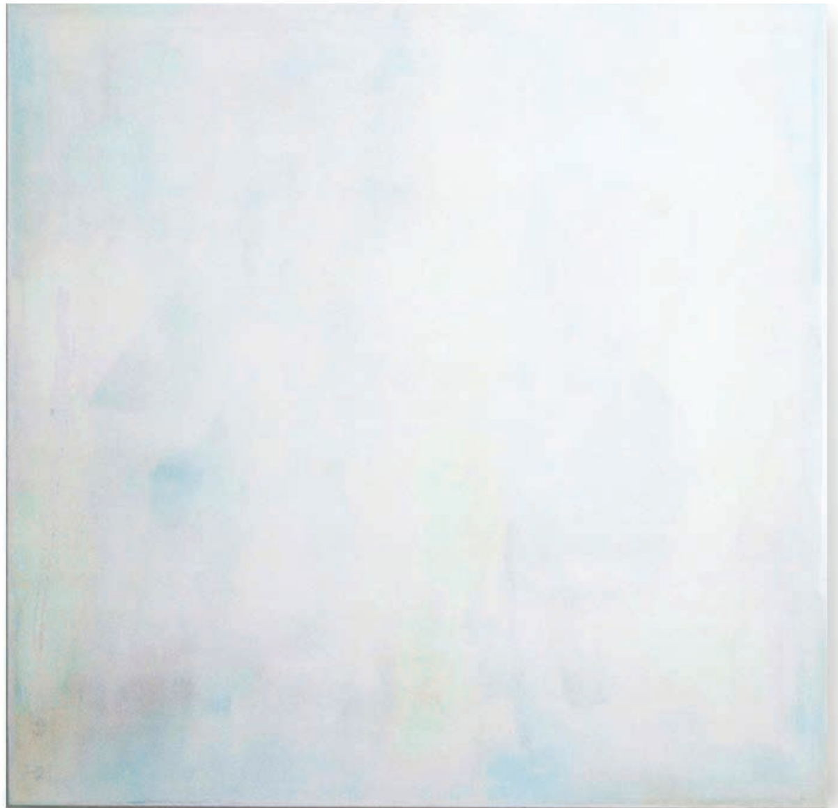
NF/ 20140226 2014 Acrílico sobre lienzo 160 x 160 cm