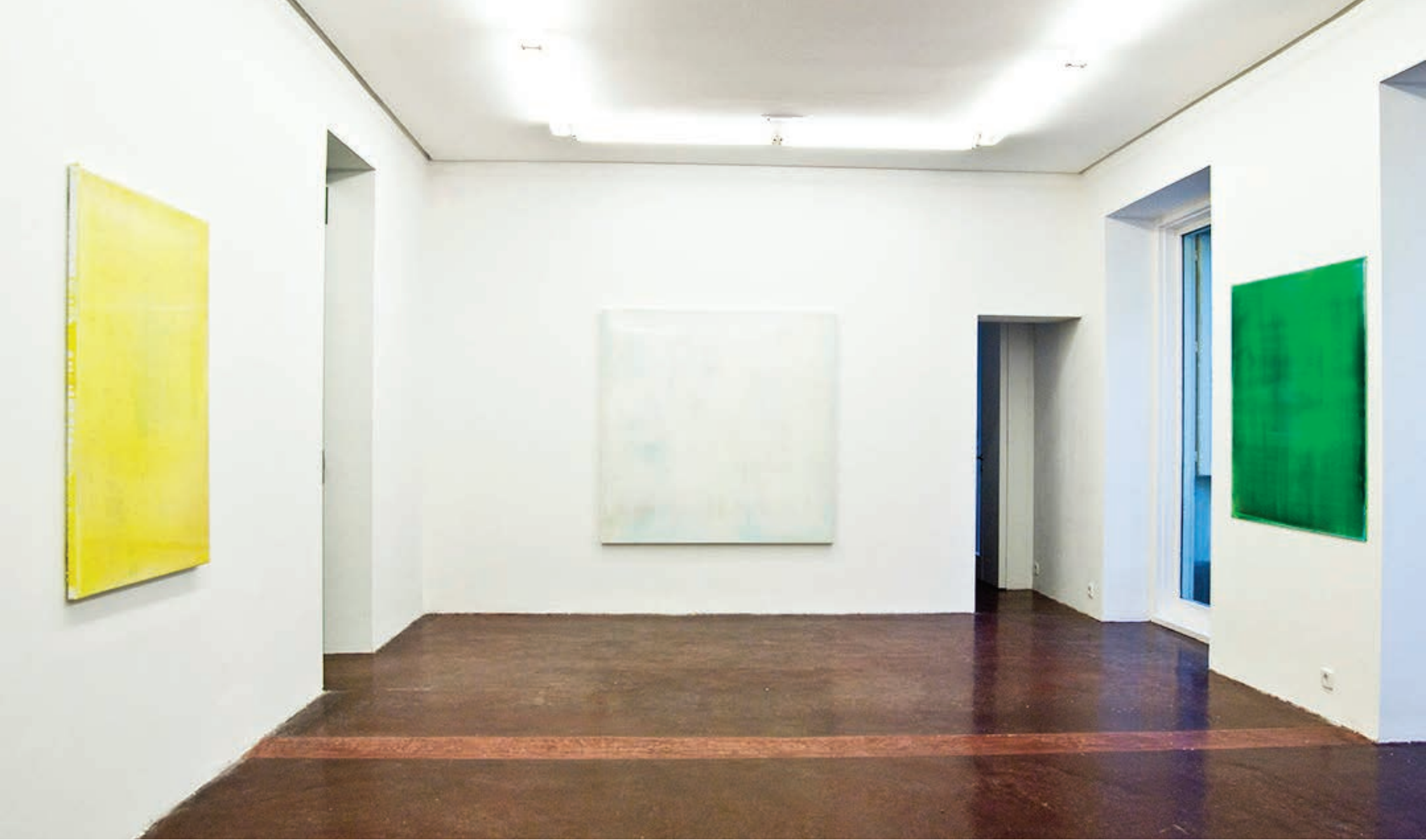
NF/ Undertow 2015 Vista general NF/ NIEVES FERNANDEZ