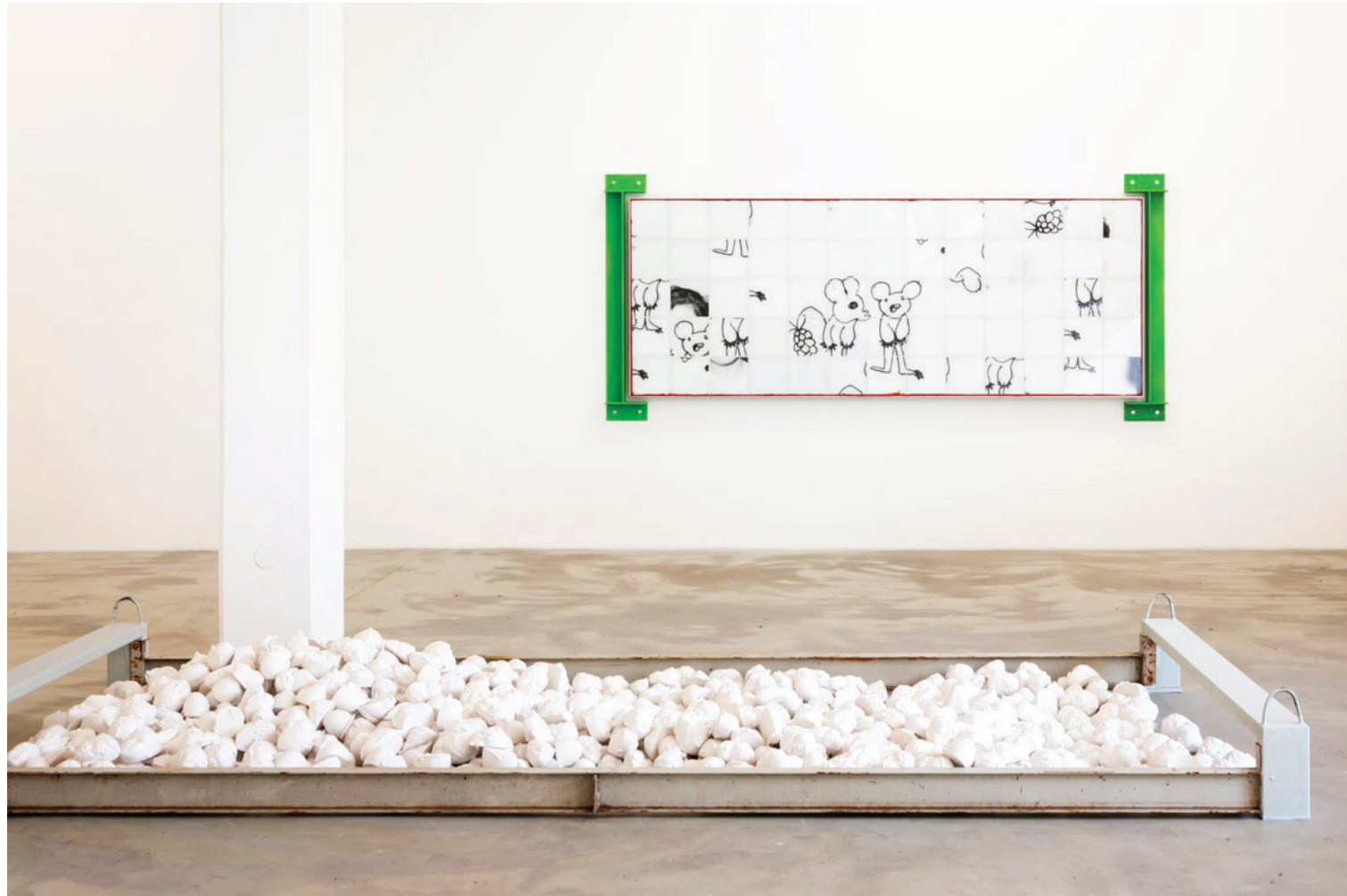
NF / Mäuse 2015 Photography, crystal and steel 129 x 292 x 10 cm