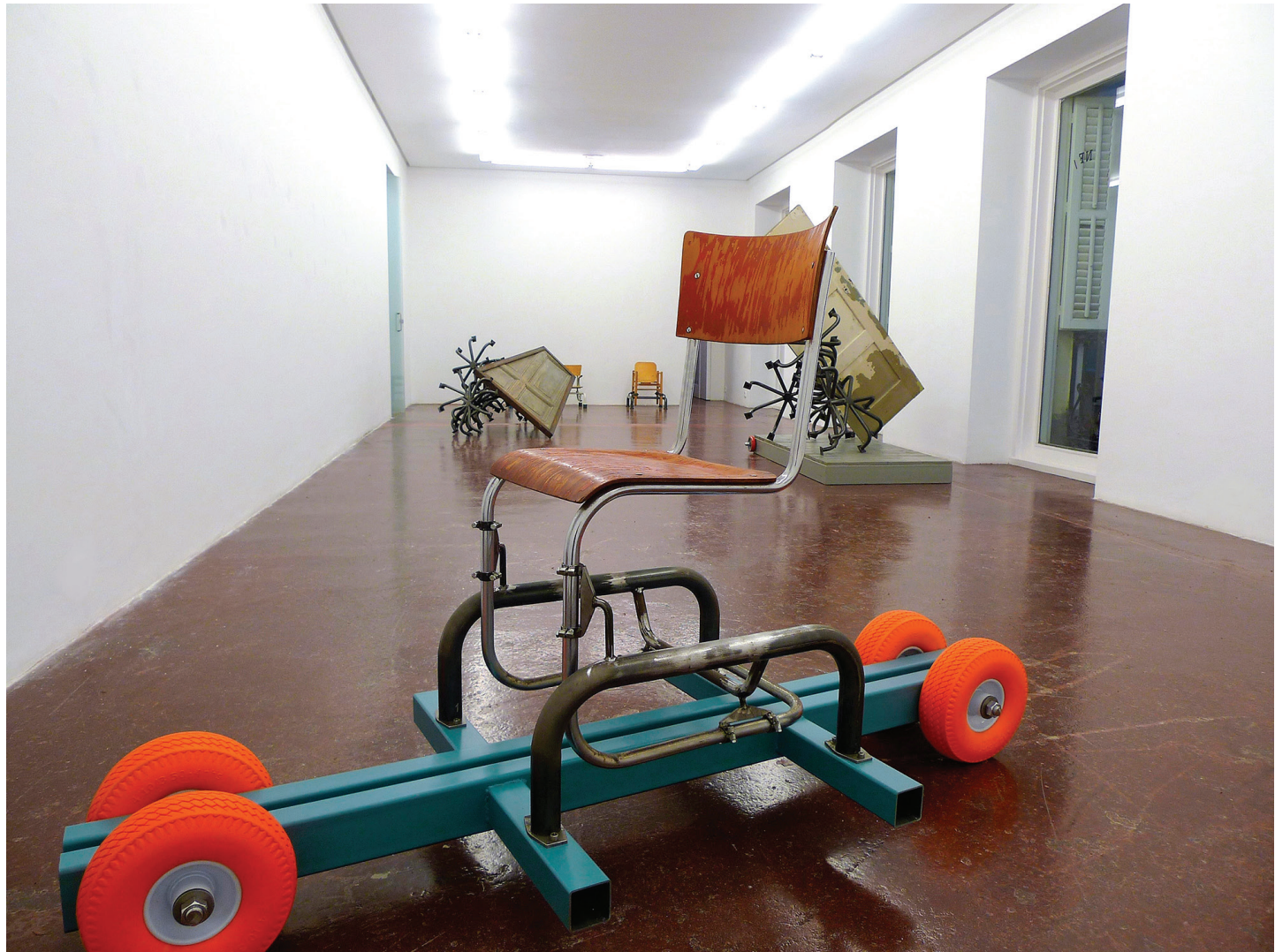
NF/ Unexpected Moves 2017 NF/ Nieves Fernández