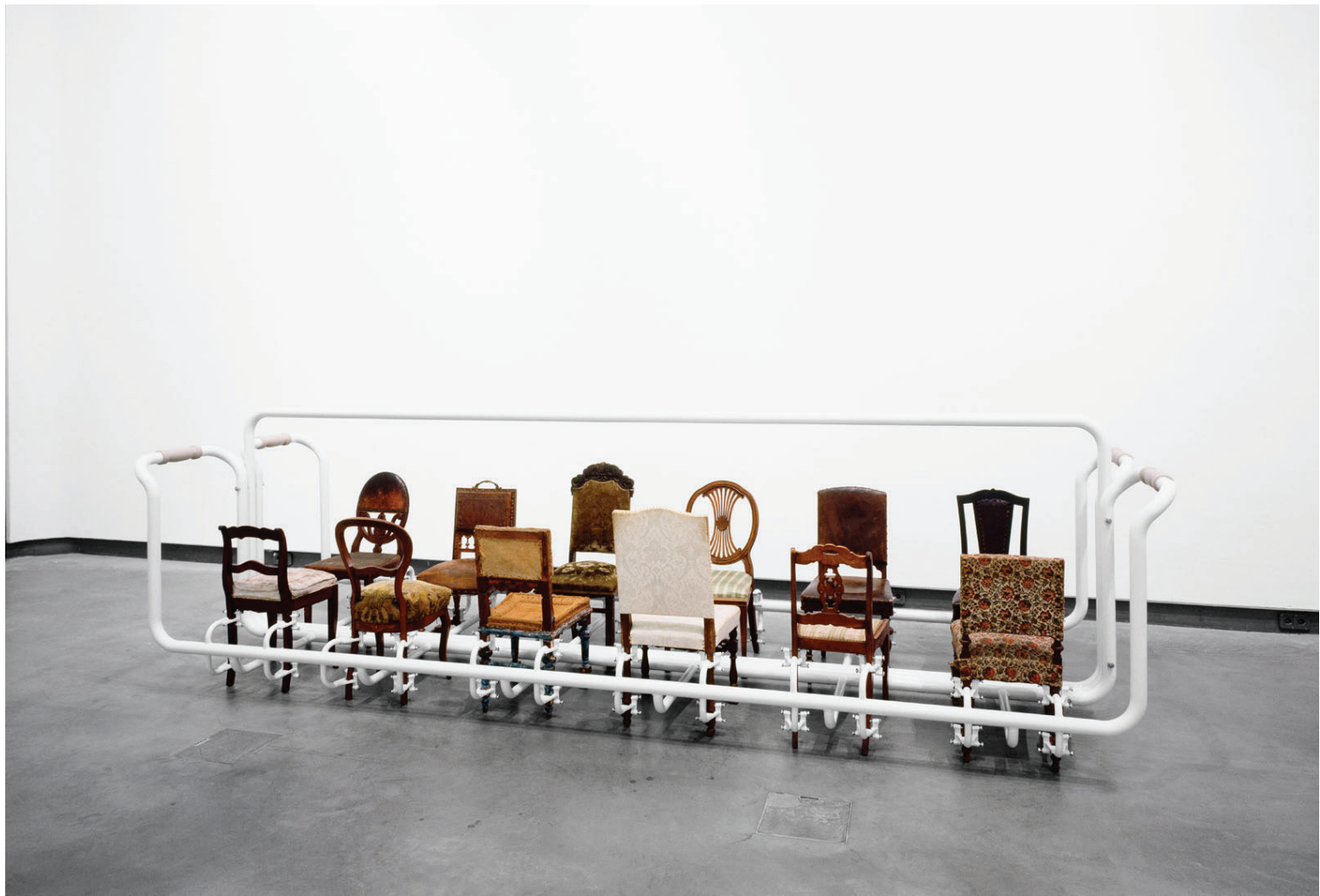
NF / BopparderKanapee 2005 Chairs, steel, rubber and paint 160 x 180 x 520 cm