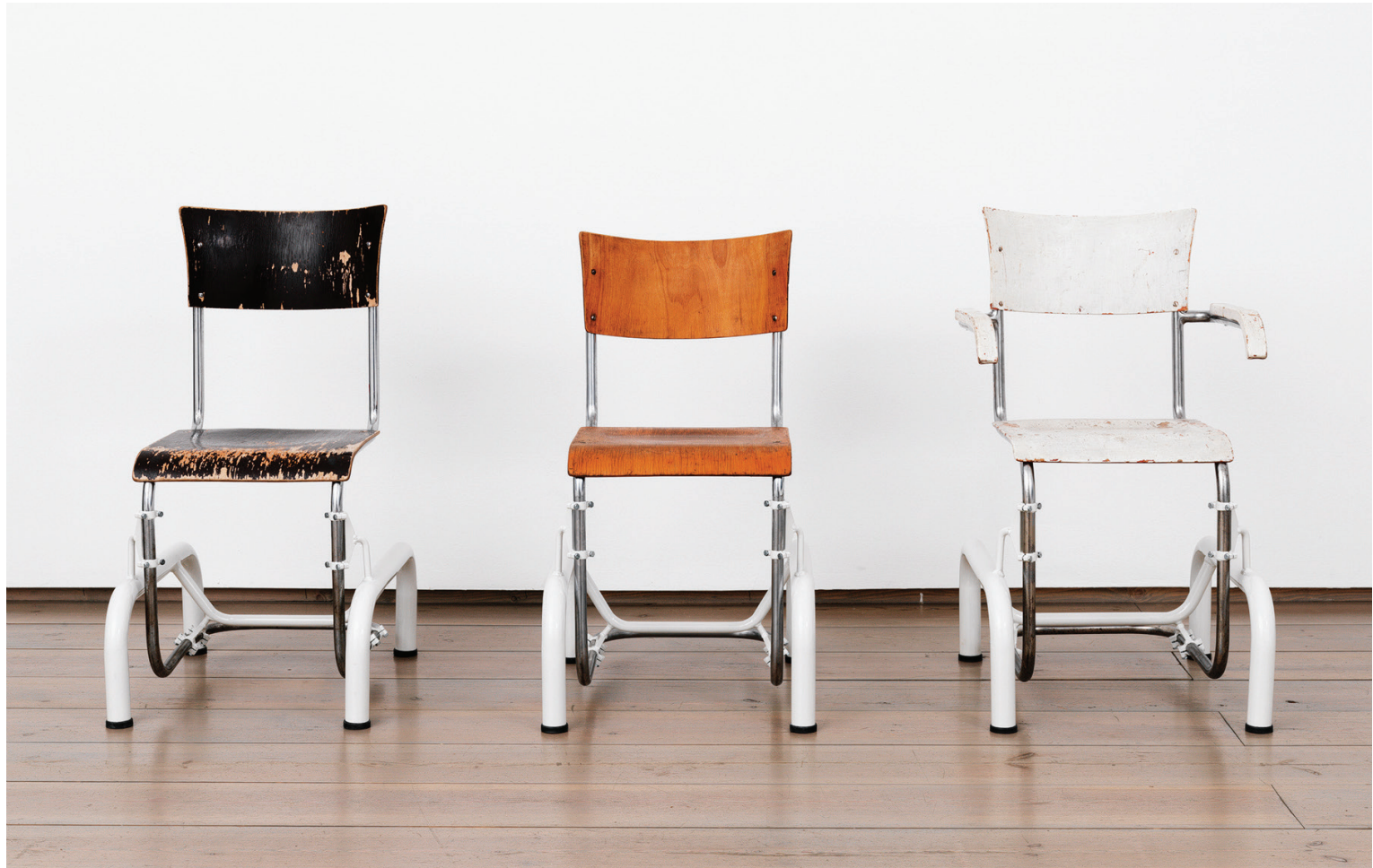
NF / Stuhl 9 (a); Stuhl 9 (b); Stuhl 9 (c) 2007 Chairs, steel and paint Installation view