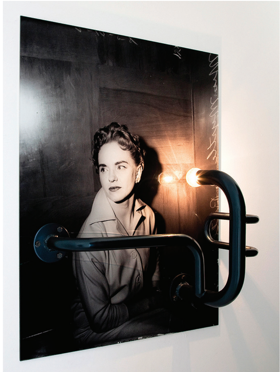
NF / Sitting in the Dark 2012 Steel, photography, crystal and lacquer 85,5 x 65 x 26 cm