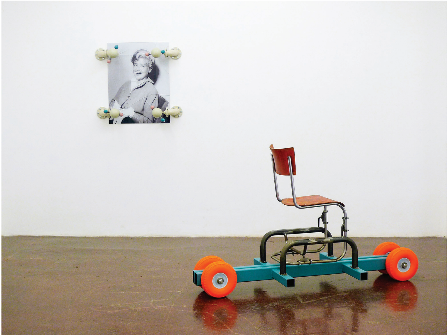
NF/ Unexpected Moves 2017 NF/ Nieves Fernández