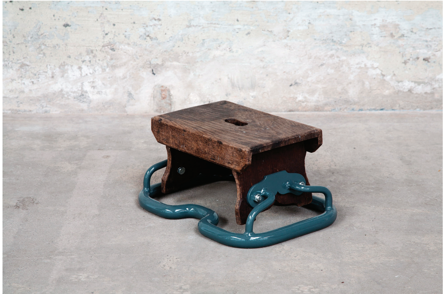
NF / Schemel 2 2009 Wood, steel and paint 18,5 x 38,5 x 19 cm