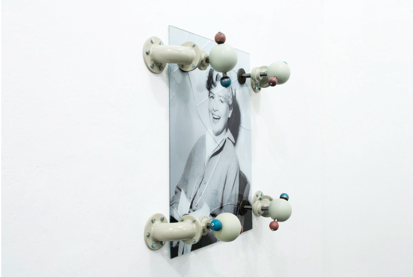
NF / Globales Phänomen 2012 Steel, photography, crystal and lacquer 81 x 93 x 21 cm