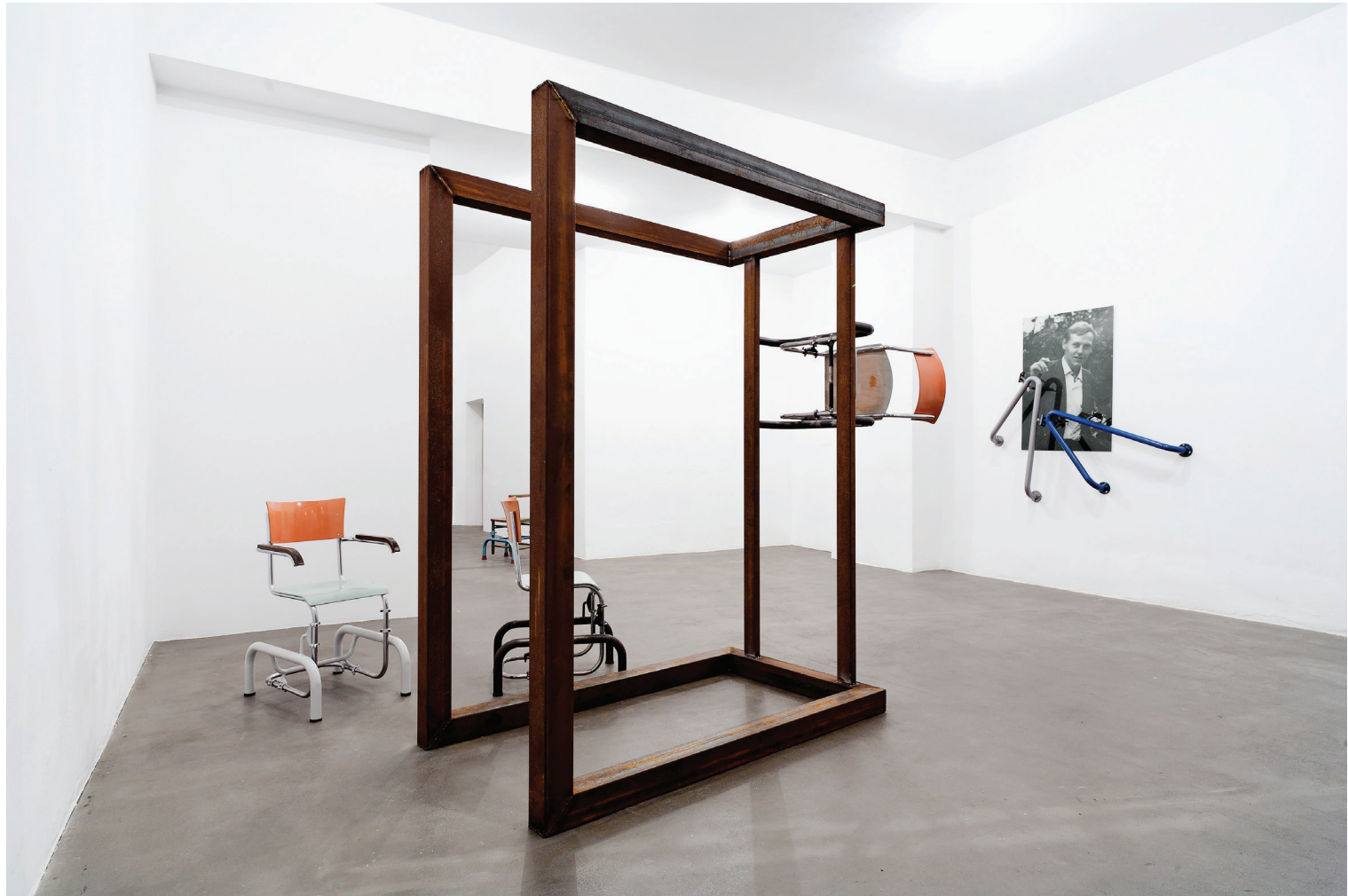
NF/ Globales Phänomen 2012 Steel, photography, crystal and lacquer 81 x 93 x 21 cm