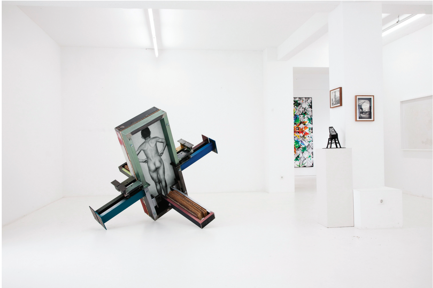
NF/ Background 2011 Mixed media 165 x 200 x 180 cm