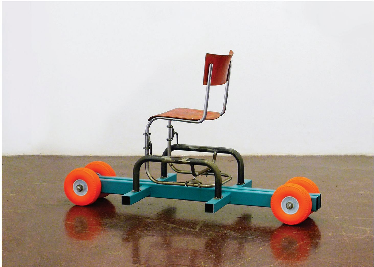
NF/ Futura 2017 Steel, chair, rubber, paint 105 x 175 x 73 cm