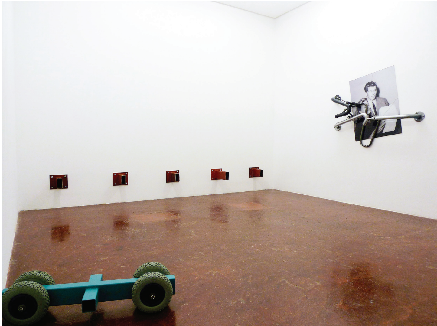
NF/ Unexpected Moves 2017 NF/ Nieves Fernández