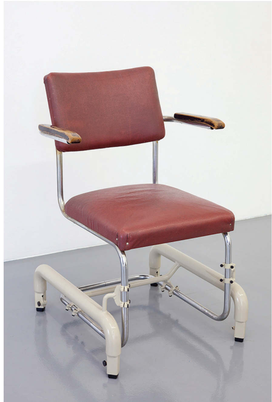
NF / Polsterstuhl 3 2013 Chair, steel and lacquer 87 x 61 x 56 cm