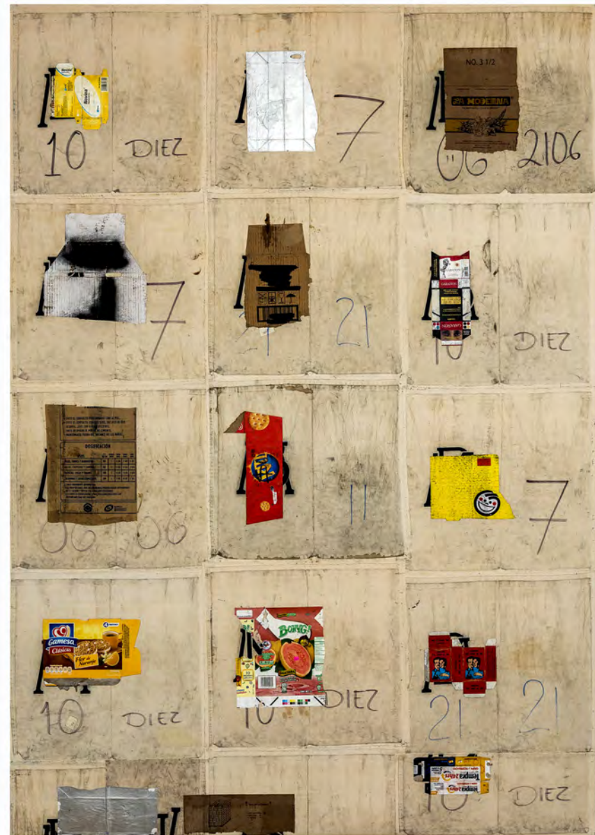
NF/ Moris Bandera blanca III 2019 Collage, dirt and ink on canvas 213 x 150 cm