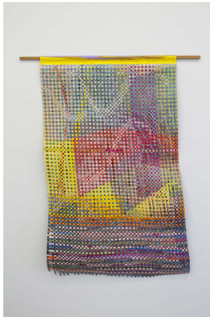
NF/ Daniela Libertad Dibujo tejido 11 [side A] 2021 Color pencil on paper 129 x 76 cm