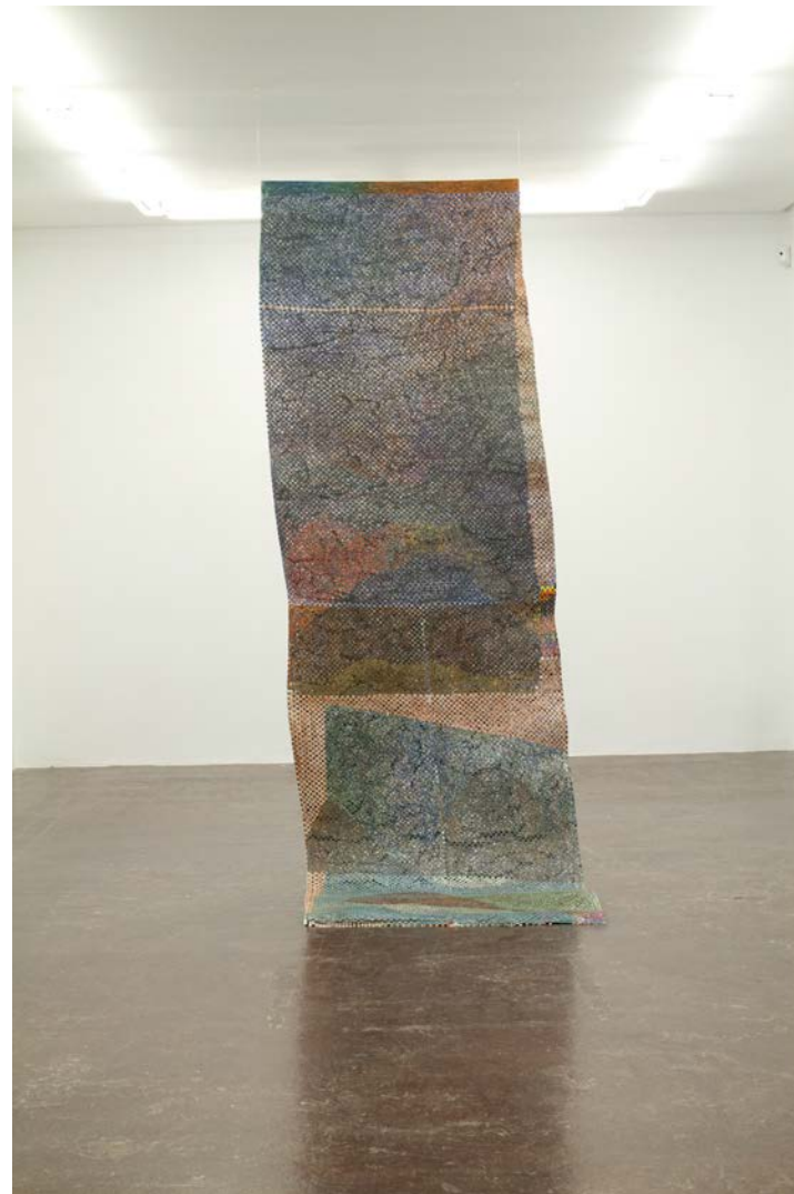
NF/ Daniela Libertad Dibujo tejido 8 [side A] 2021 Color pencil on paper 351 x 100 cm