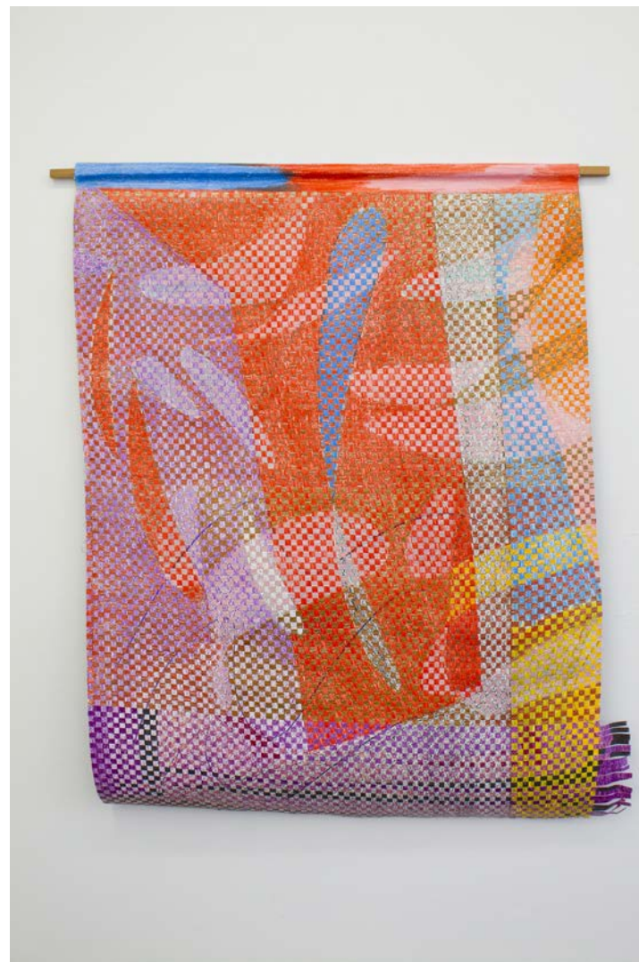
NF/ Daniela Libertad Dibujo tejido 9 [side A] 2021 Color pencil on paper 124 x 100 cm