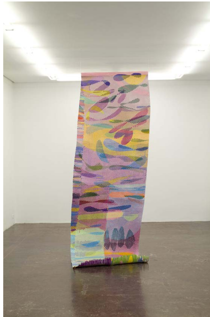
NF/ Daniela Libertad Dibujo tejido 6 [side A] 2021 Color pencil on paper 346 x 100 cm