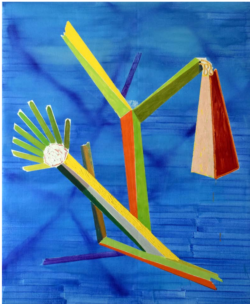
NF/ Blue Note 2021 Oil on canvas 160 x 130 cm