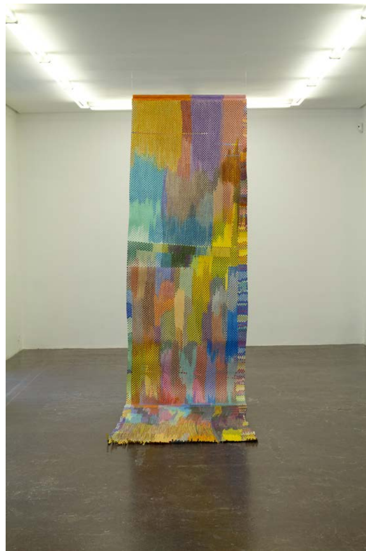
NF/ Daniela Libertad Dibujo tejido 5 [side A] 2021 Color pencil on paper 449 x 100 cm