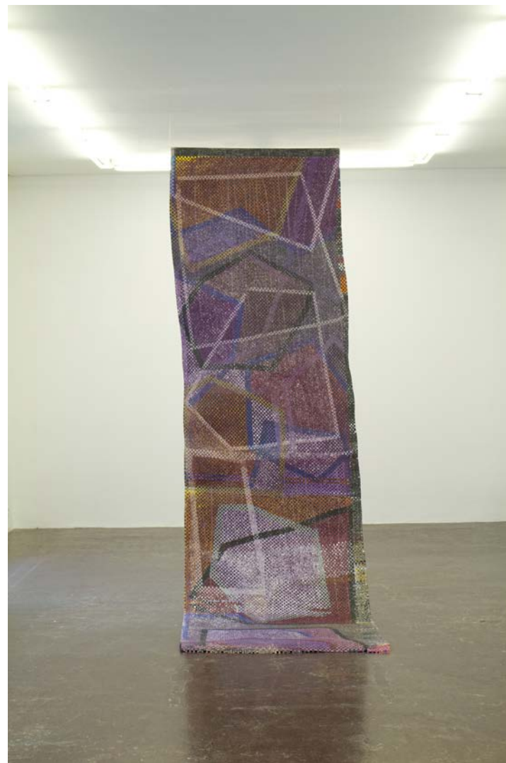
NF/ Daniela Libertad Dibujo tejido 7 [side A] 2021 Color pencil on paper 366 x 100 cm