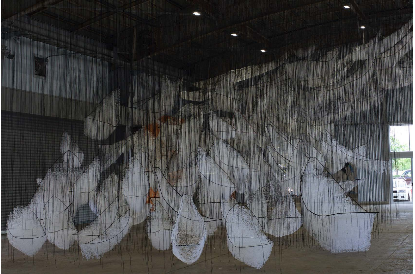
NF / Where are we going 2018 Vistas de instalación Niigata Art Festival