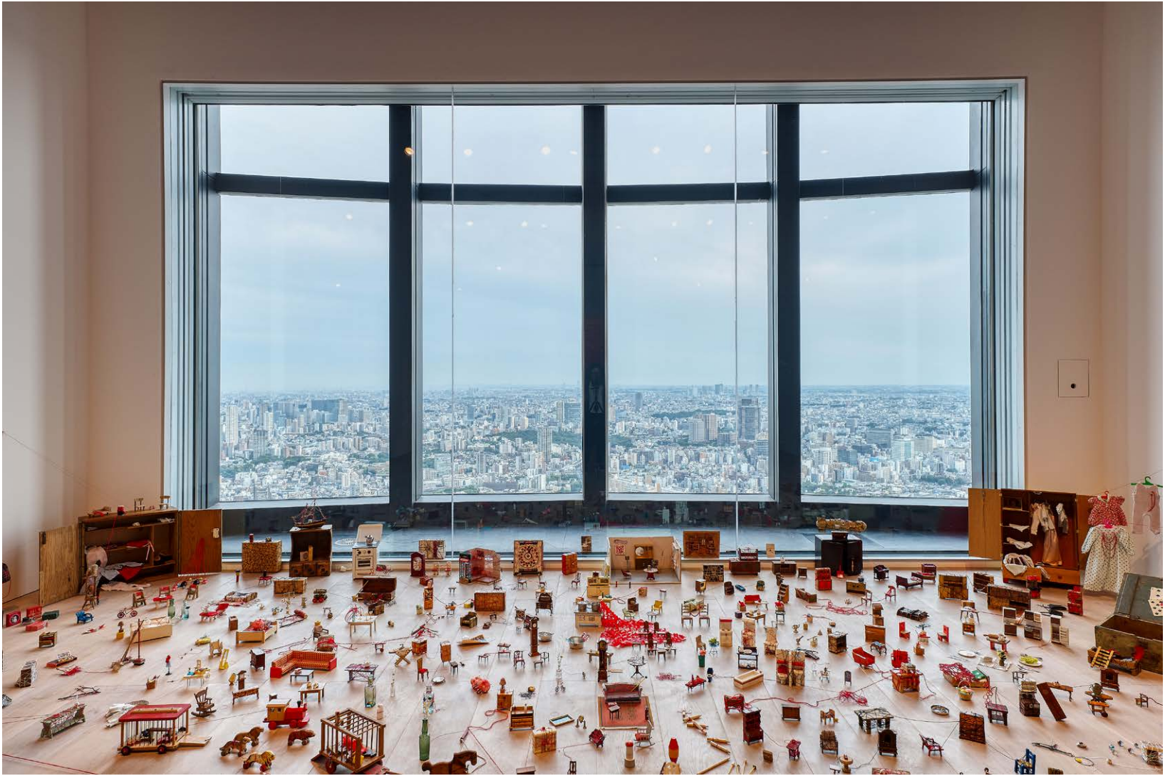
NF / Connecting Small Memories 2019 Vistas de instalación The Soul Trembles, Mori Art Museum, Tokyo