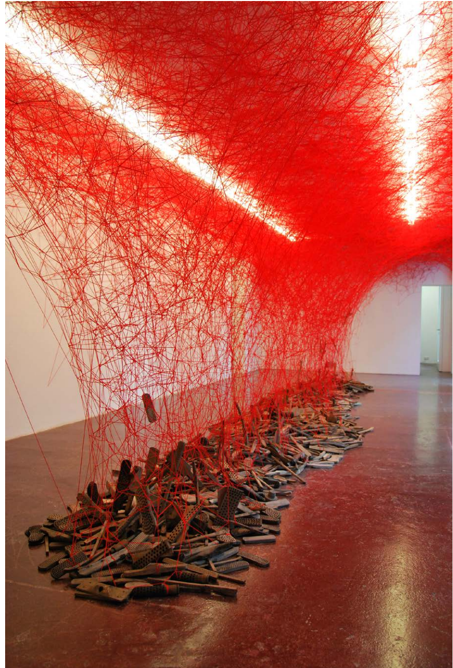
NF / Remind of... 2018 Vistas de instalación NF/NIEVES FERNÁNDEZ, Madrid