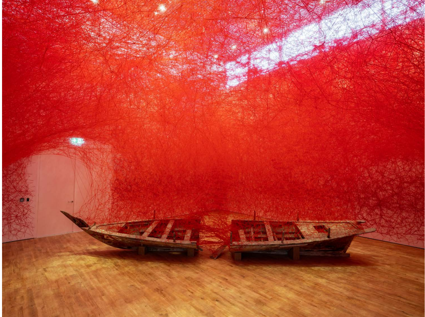
NF / Departure 2018 Vistas de instalación Jameel Art Centre, Dubai