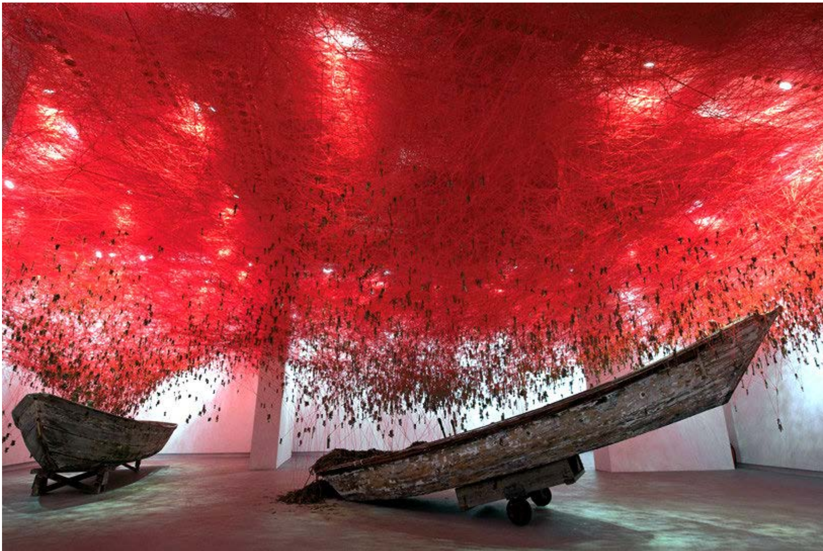
NF / The key in the Hand 2015 Vistas de instalación Pabellón de Japón, 56ª Bienal de Venecia