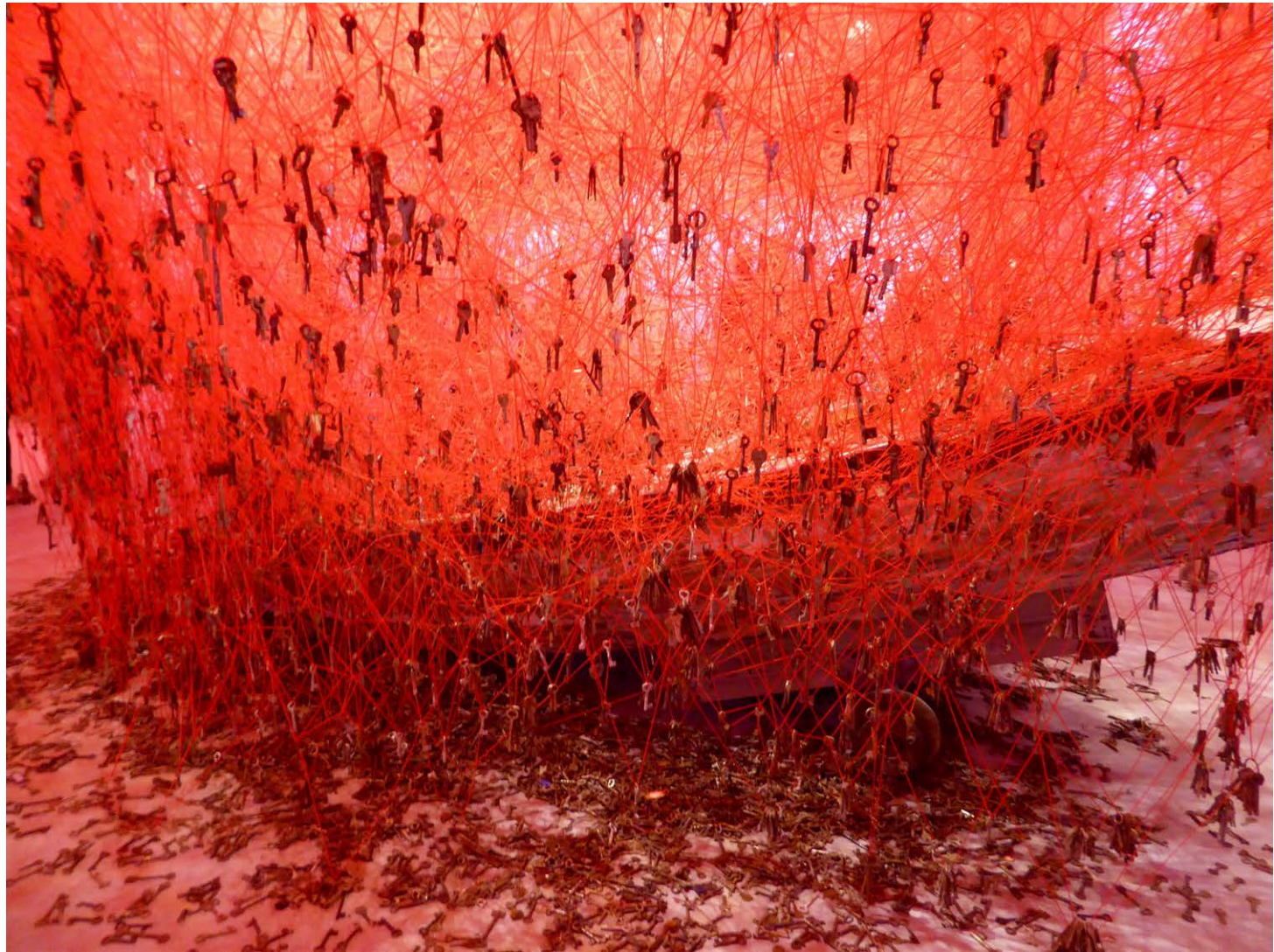
NF / The key in the Hand 2015 Vistas de instalación Pabellón de Japón, 56ª Bienal de Venecia