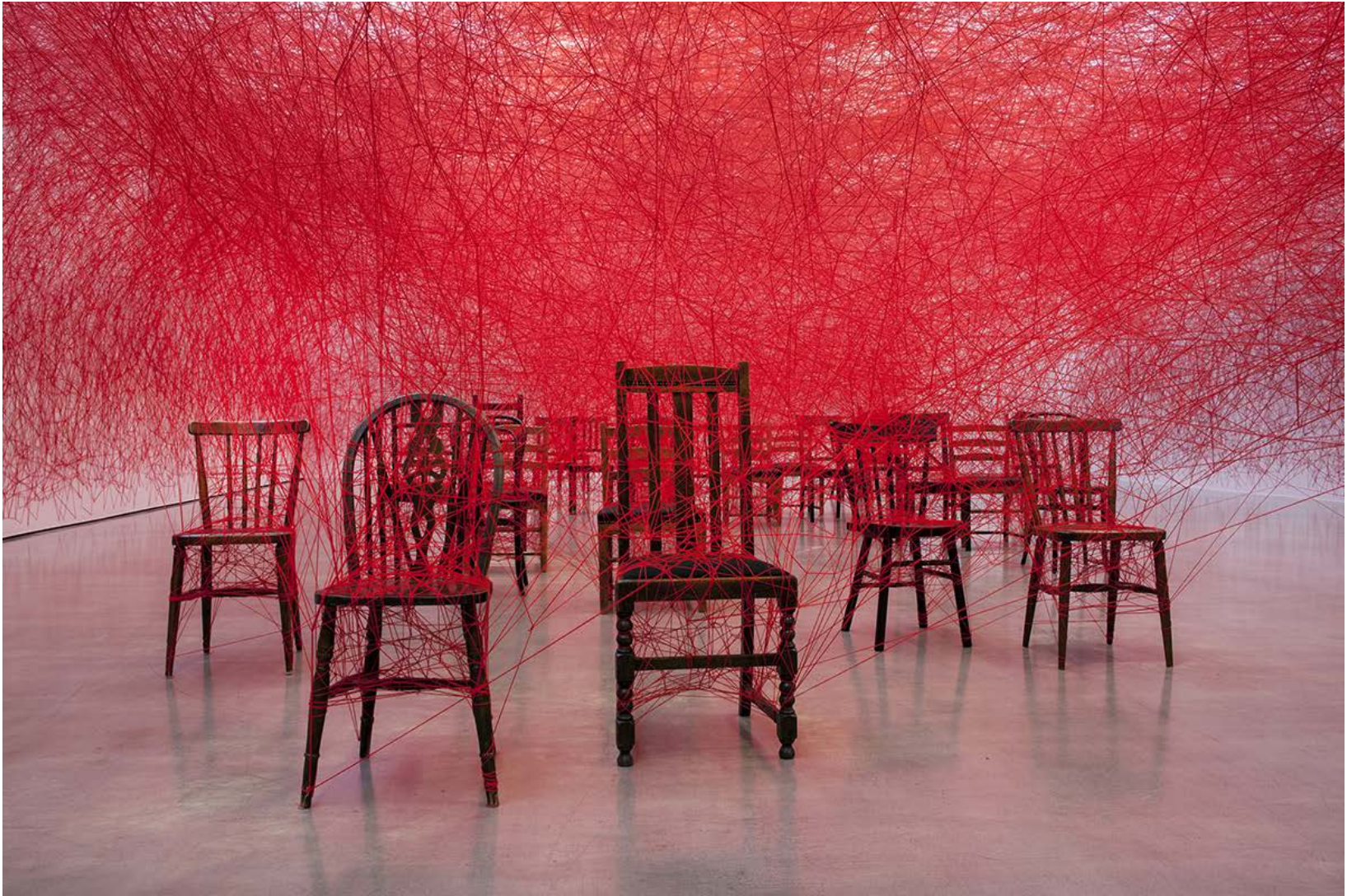
NF / The distance 2018 Vistas de instalación Gottesborg Museum, Gotemburgo