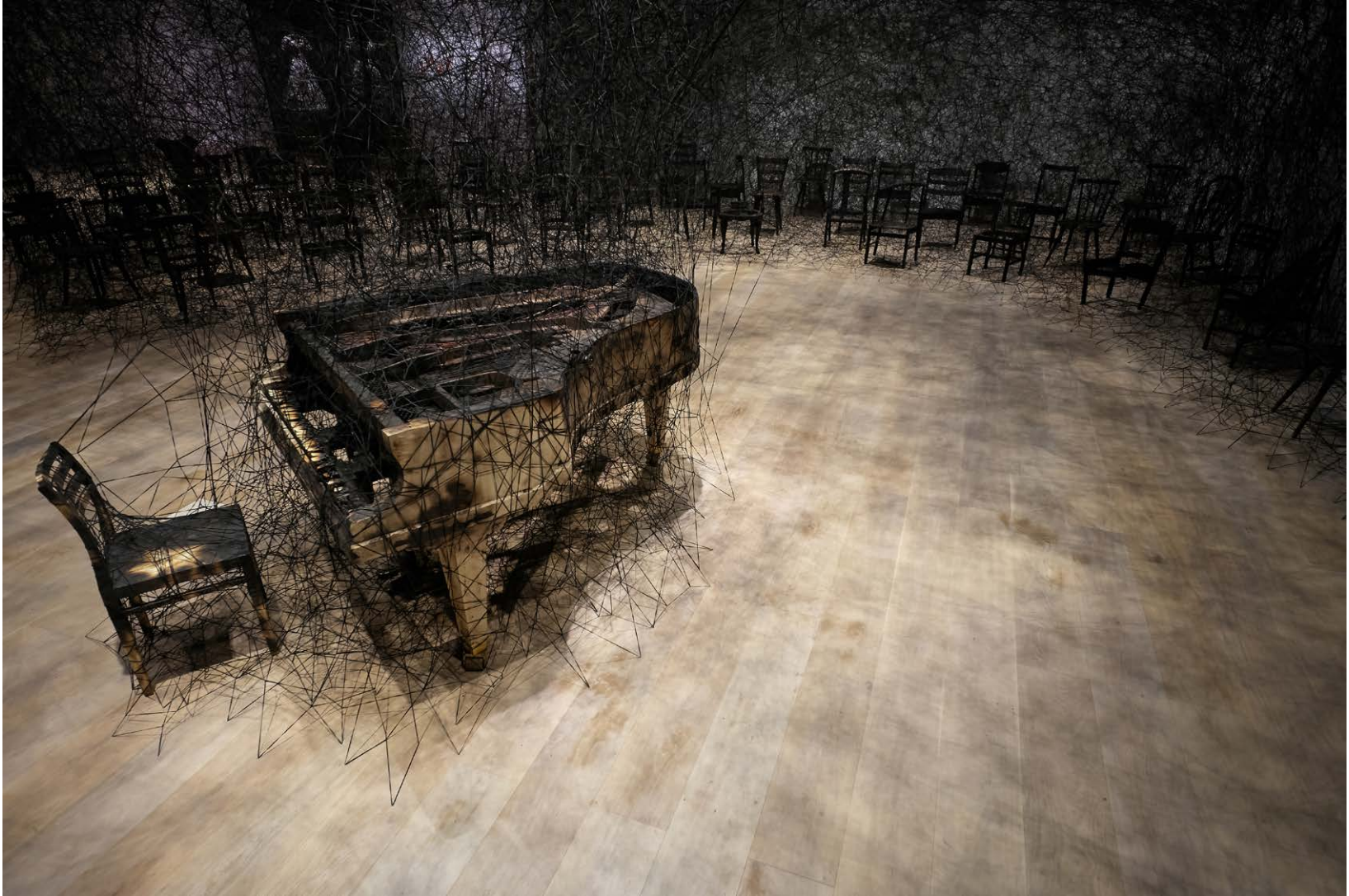
NF / In Silence 2019 Vistas de instalación The Soul Trembles, Mori Art Museum, Tokyo