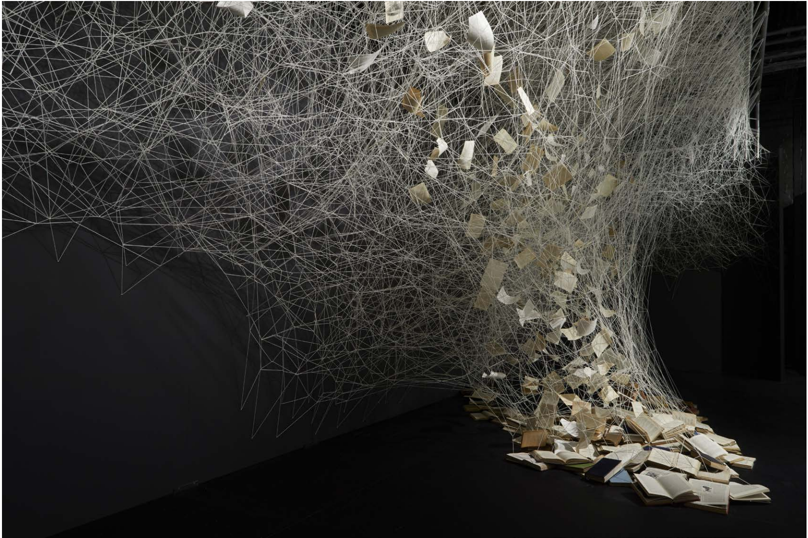
NF / The Crossing 2018 Vistas de instalación Melbourne Art Fair