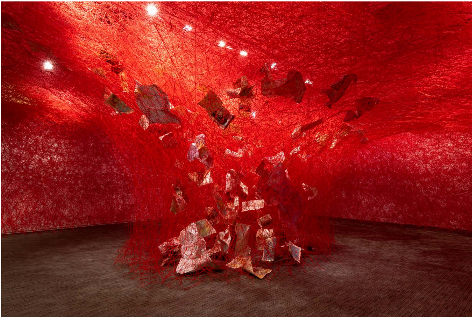
NF / Crossroads 2019 Vistas de instalación Make Wrong / Right / Now, Honolulu Biennial