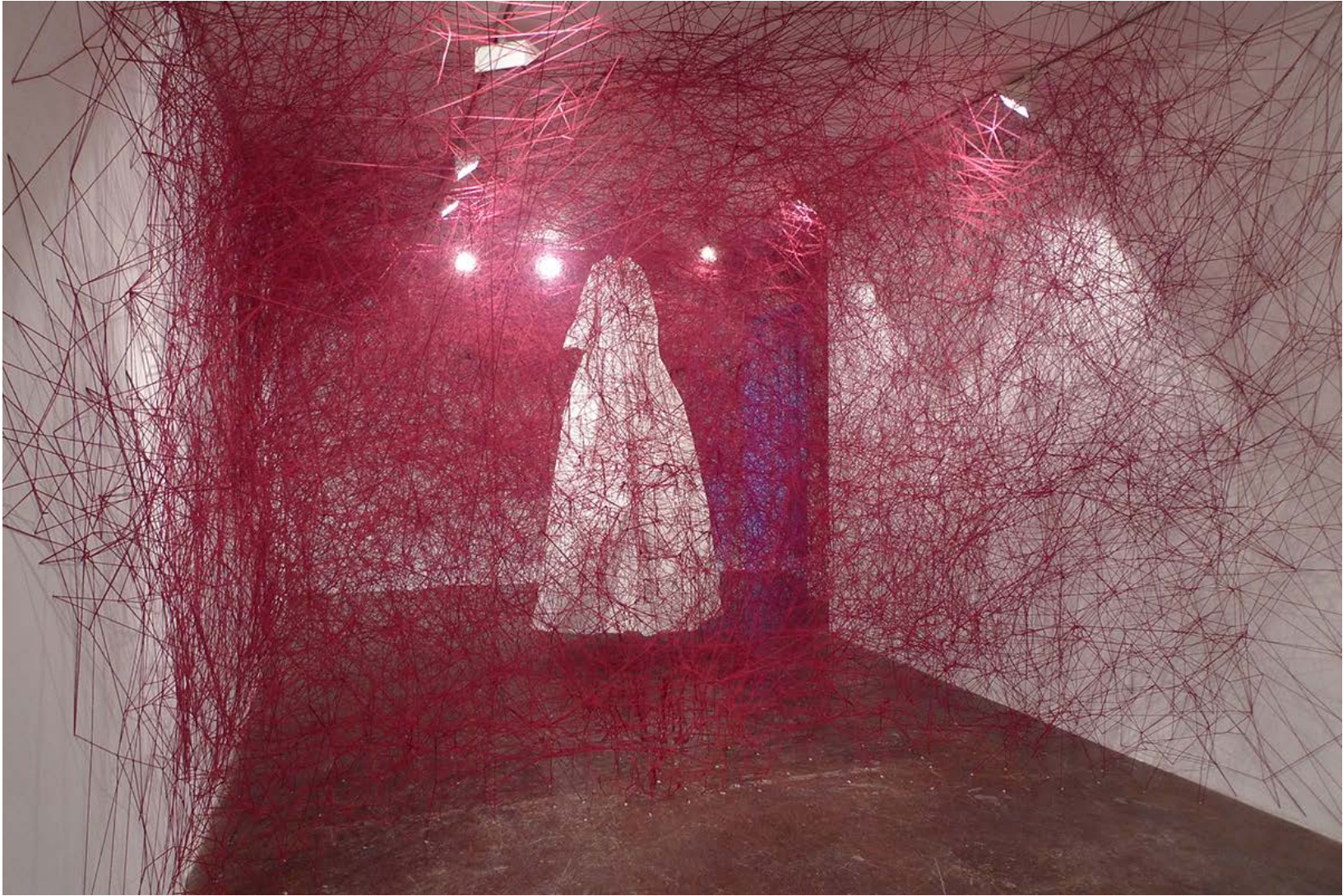
NF / Earth & Blood 2014 Vistas de instalación NF/NIEVES FERNÁNDEZ, Madrid