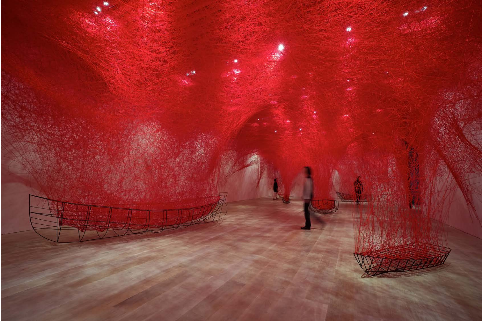
NF / Uncertain Journey 2019 Vistas de instalación The Soul Trembles, Mori Art Museum, Tokyo