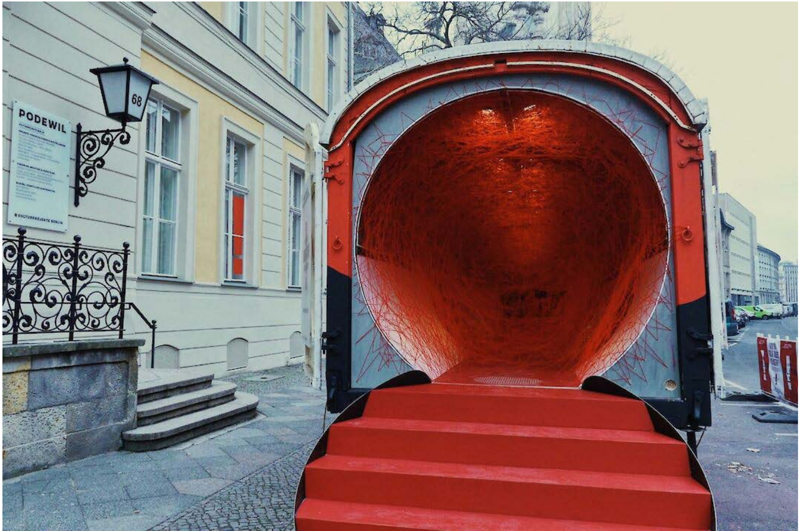
NF / 100 Years of Revolution - Berlin 1918-2019 2019 Vistas de instalación Podewil Palace, Berlin