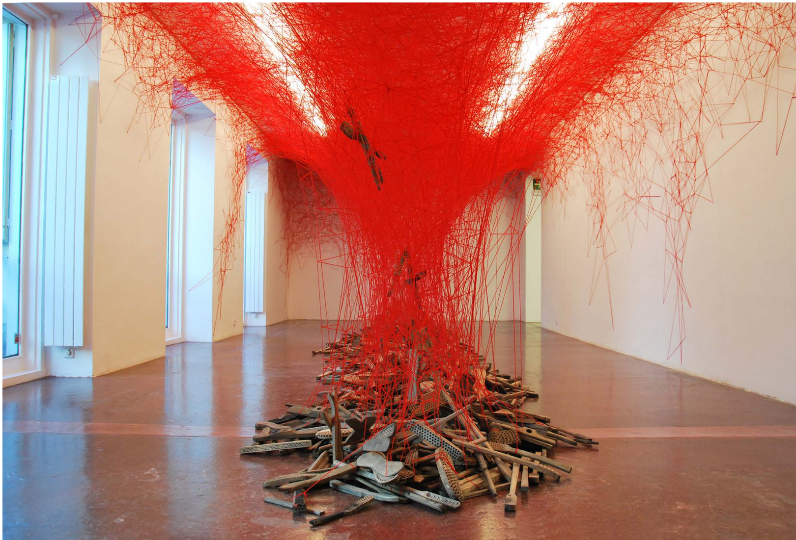
NF / Remind of... 2018 Vistas de instalación NF/NIEVES FERNÁNDEZ, Madrid