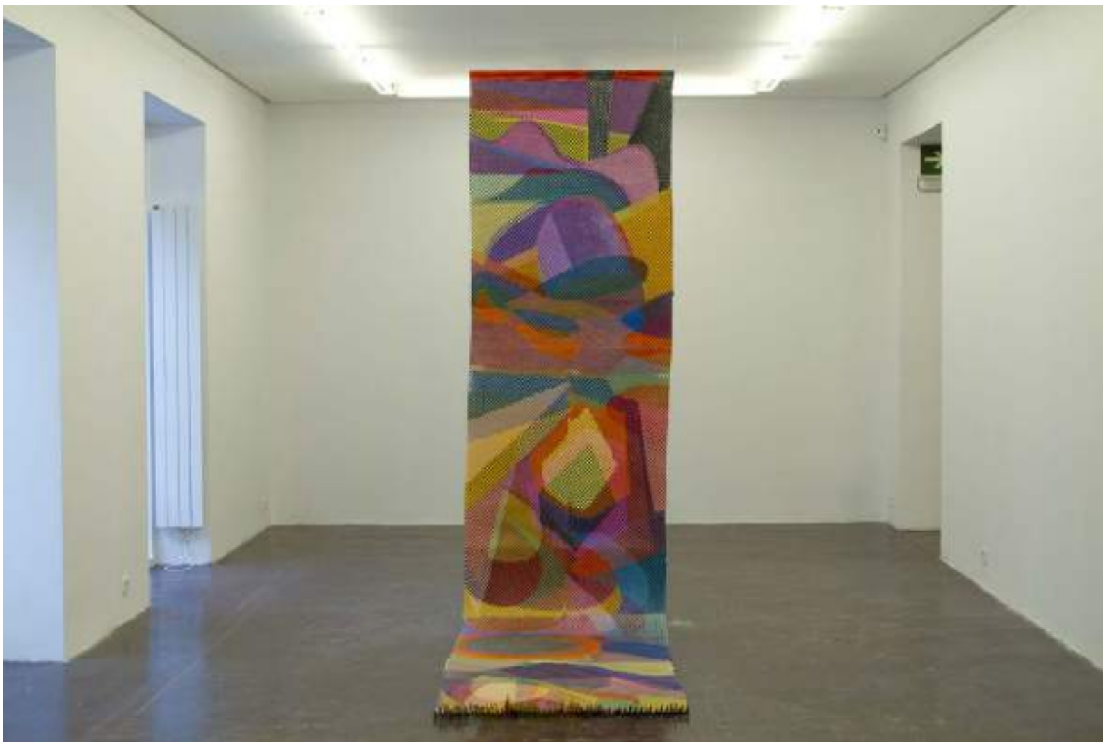
NF/ Daniela Libertad Dibujo tejido 4 [side B] 2021 Color pencil on paper 458 x 100 cm