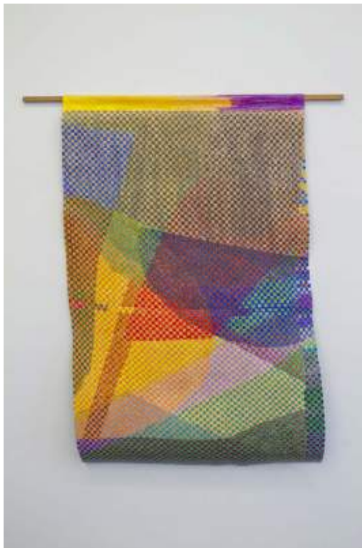
NF / Daniela Libertad Dibujo tejido 10 [side B] 2021 Color pencil on paper 123 x 80 cm