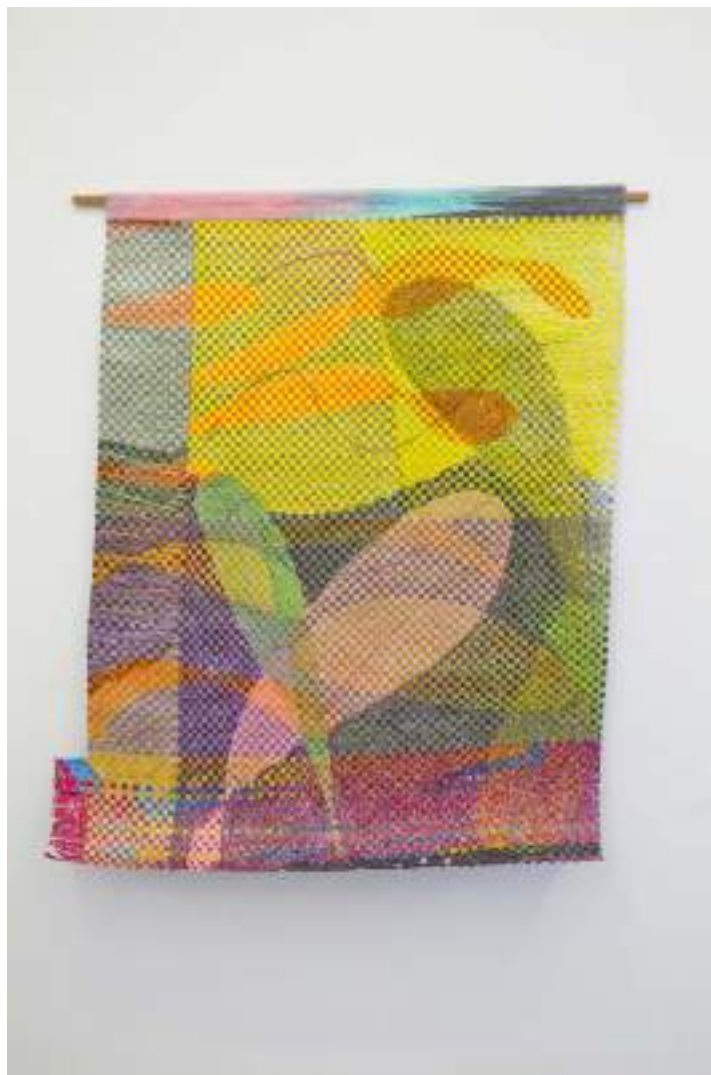
NF / Daniela Libertad Dibujo tejido 9 [side A] 2021 Color pencil on paper 124 x 100 cm