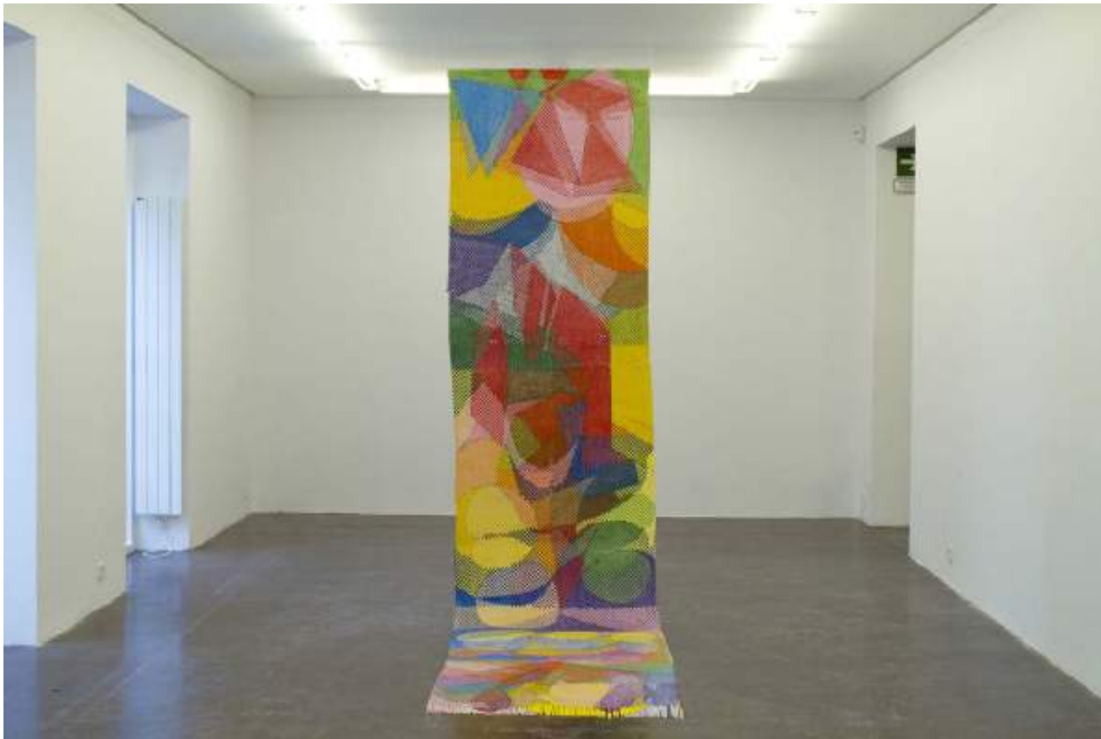
NF/ Daniela Libertad Dibujo tejido 4 [side A] 2021 Color pencil on paper 458 x 100 cm