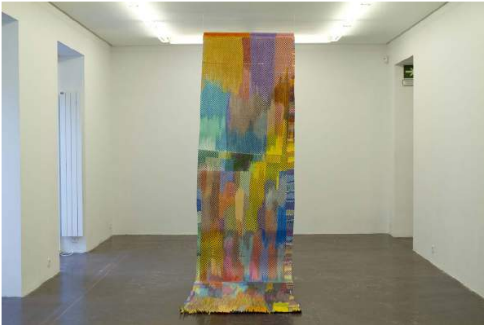
NF/ Daniela Libertad Dibujo tejido 5 [side B] 2021 Color pencil on paper 449 x 100 cm