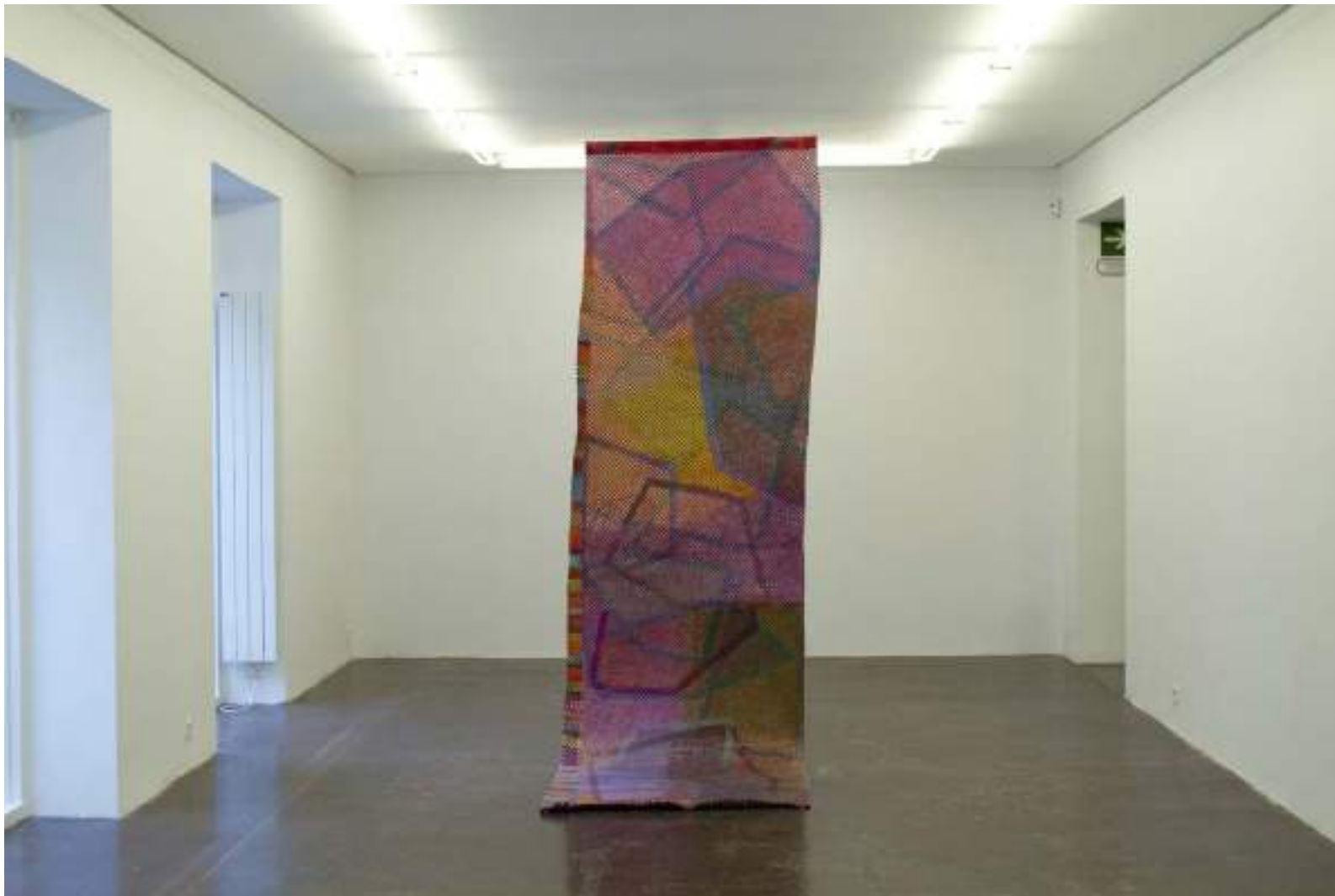
NF / Daniela Libertad Dibujo tejido 7 [side A] 2021 Color pencil on paper 366 x 100 cm