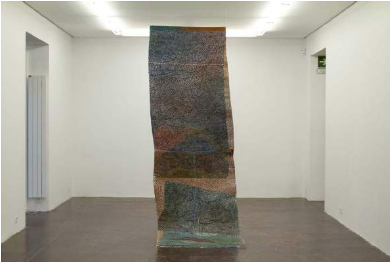
NF/ Daniela Libertad Dibujo tejido 8 [side B] 2021 Color pencil on paper 351 x 100 cm