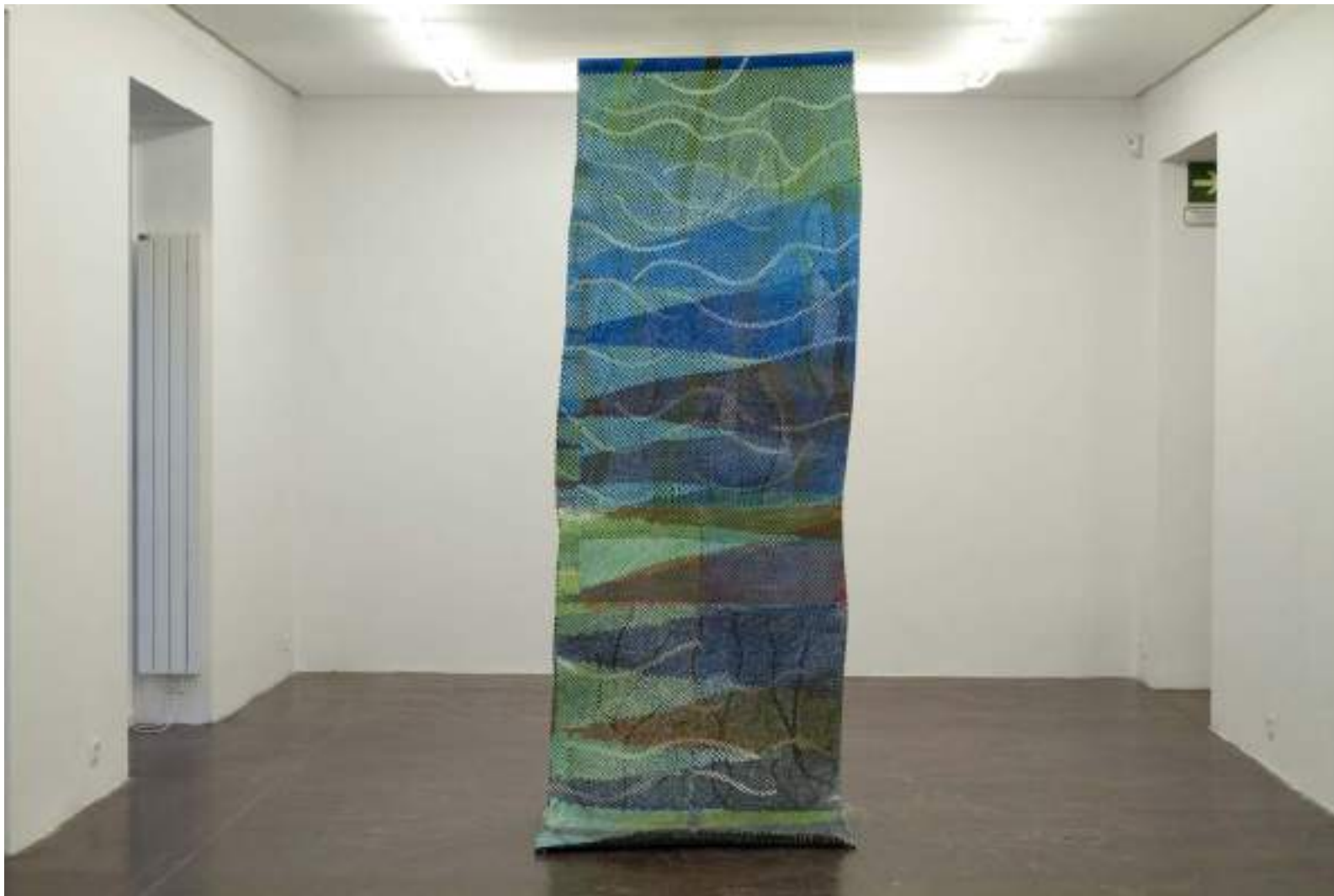
NF / Daniela Libertad Dibujo tejido 8 [side A] 2021 Color pencil on paper 351 x 100 cm