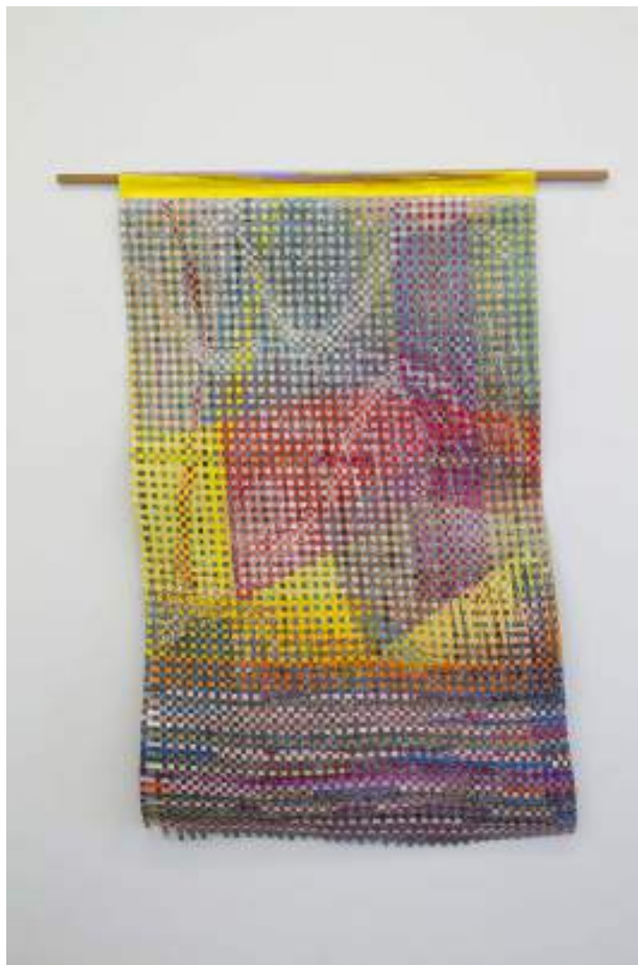
NF / Daniela Libertad Dibujo tejido 11 [side B] 2021 Color pencil on paper 129 x 76 cm