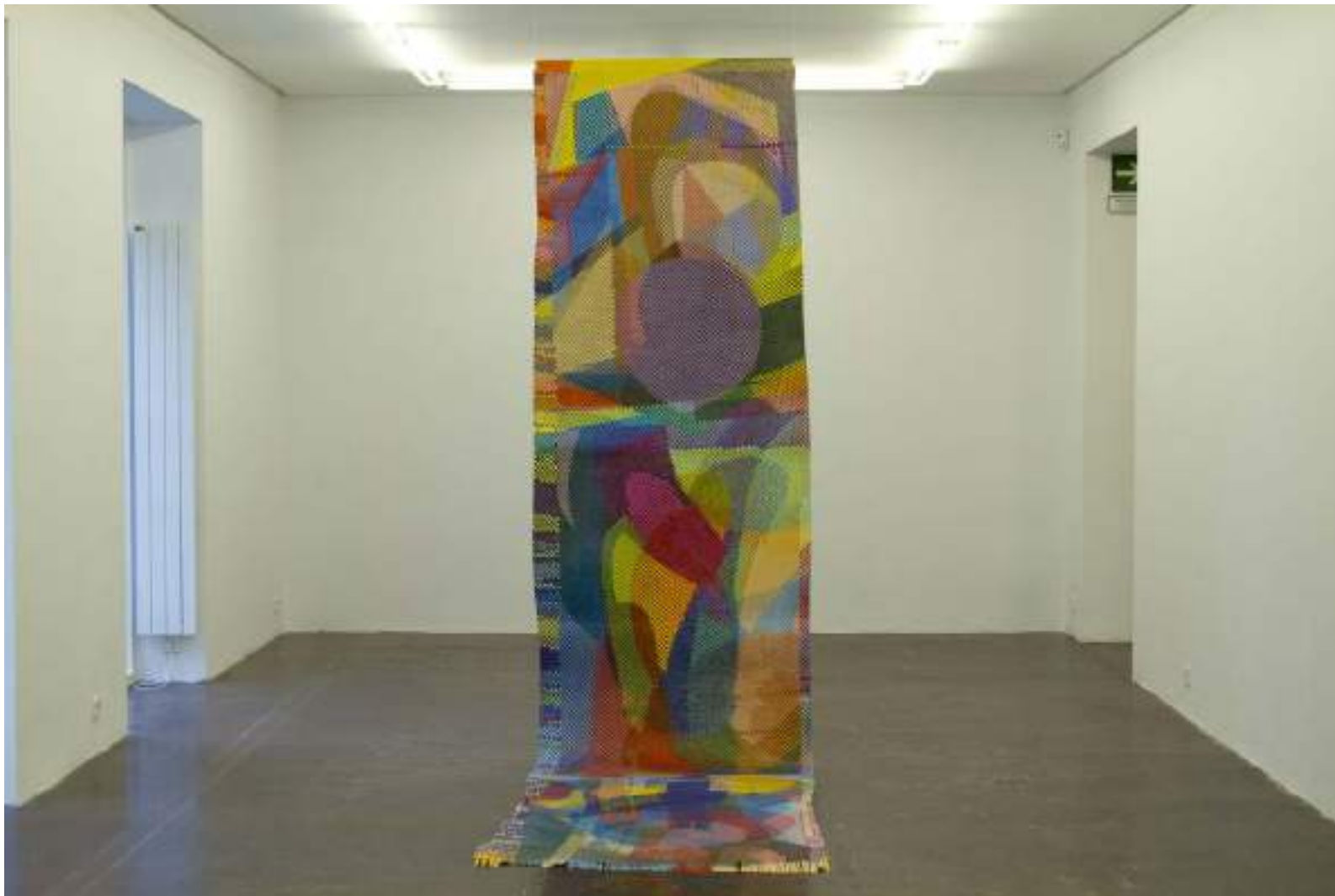
NF / Daniela Libertad Dibujo tejido 5 [side A] 2021 Color pencil on paper 449 x 100 cm