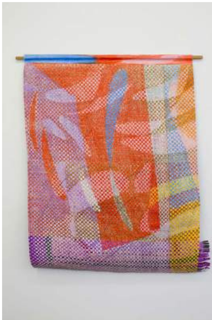
NF / Daniela Libertad Dibujo tejido 9 [side B] 2021 Color pencil on paper 124 x 100 cm