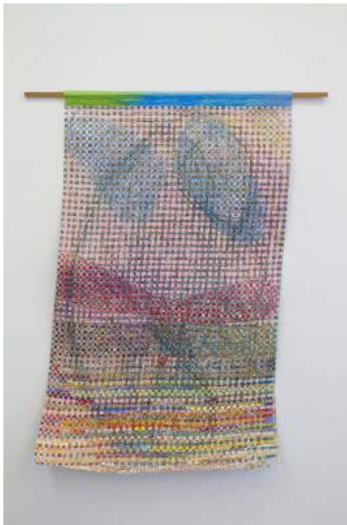
NF / Daniela Libertad Dibujo tejido 11 [side A] 2021 Color pencil on paper 129 x 76 cm