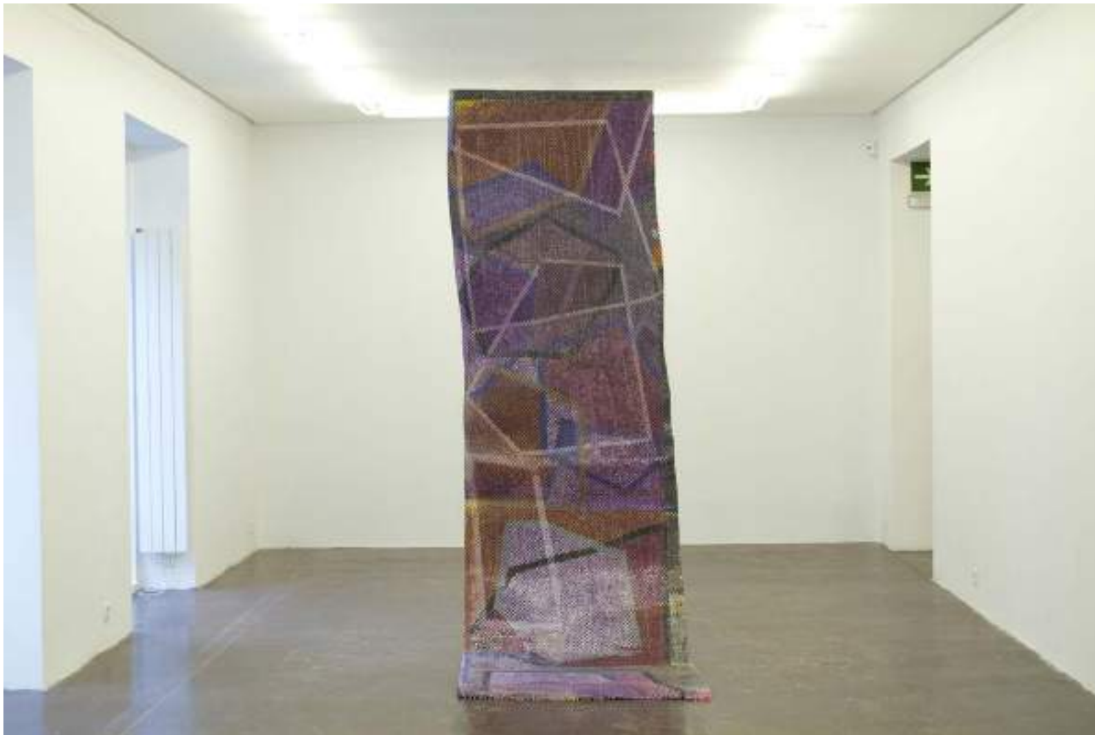
NF/ Daniela Libertad Dibujo tejido 7 [side B] 2021 Color pencil on paper 366 x 100 cm