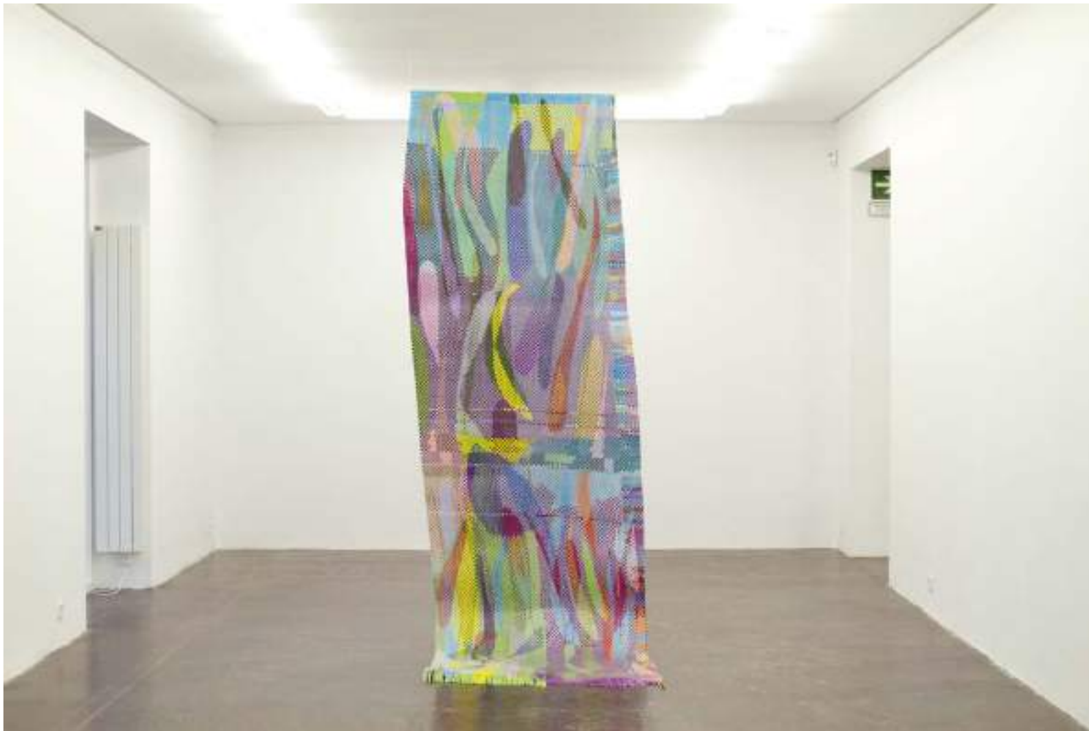
NF / Daniela Libertad Dibujo tejido 6 [side A] 2021 Color pencil on paper 346 x 110 cm