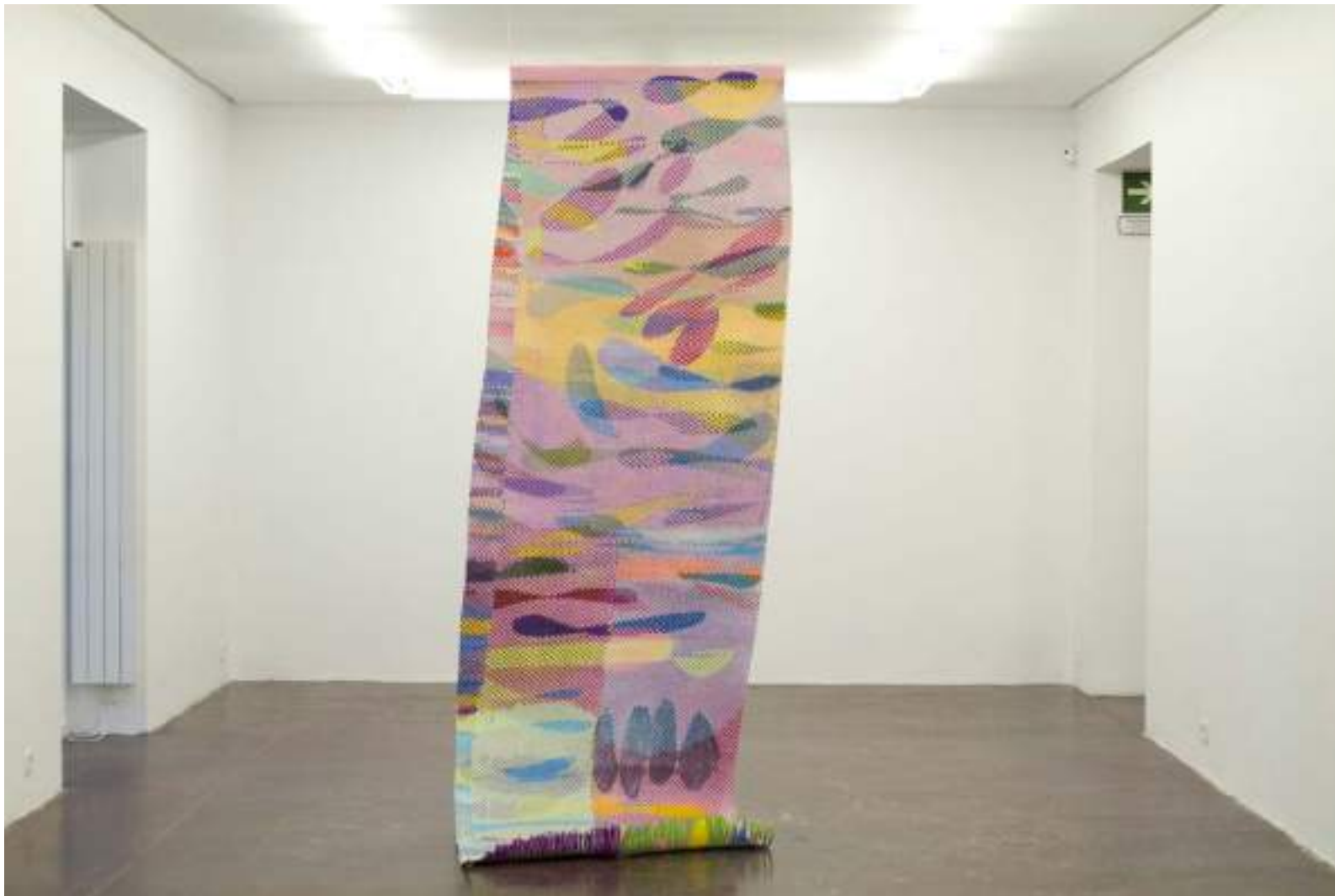
NF/ Daniela Libertad Dibujo tejido 6 [side B] 2021 Color pencil on paper 346 x 110 cm