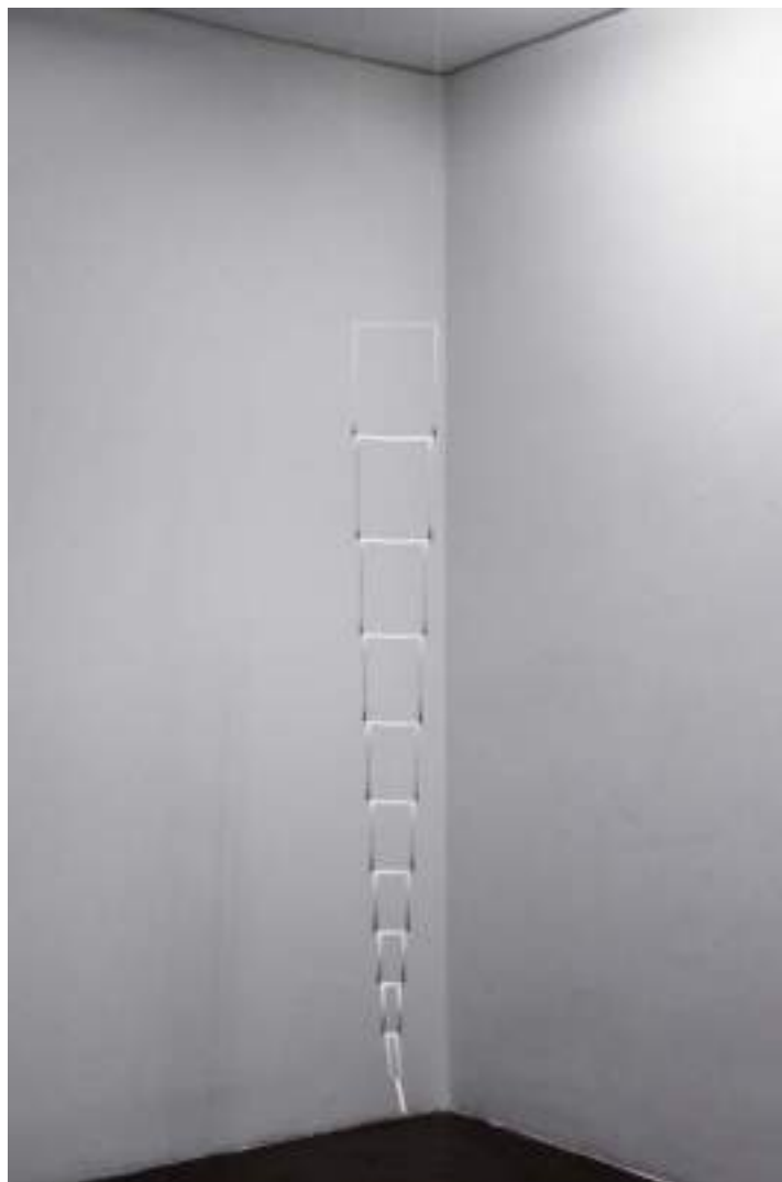
NF / Daniela Libertad Desdoble 1 2020 Cropped paper 192 x 21 cm Ed. 1/3