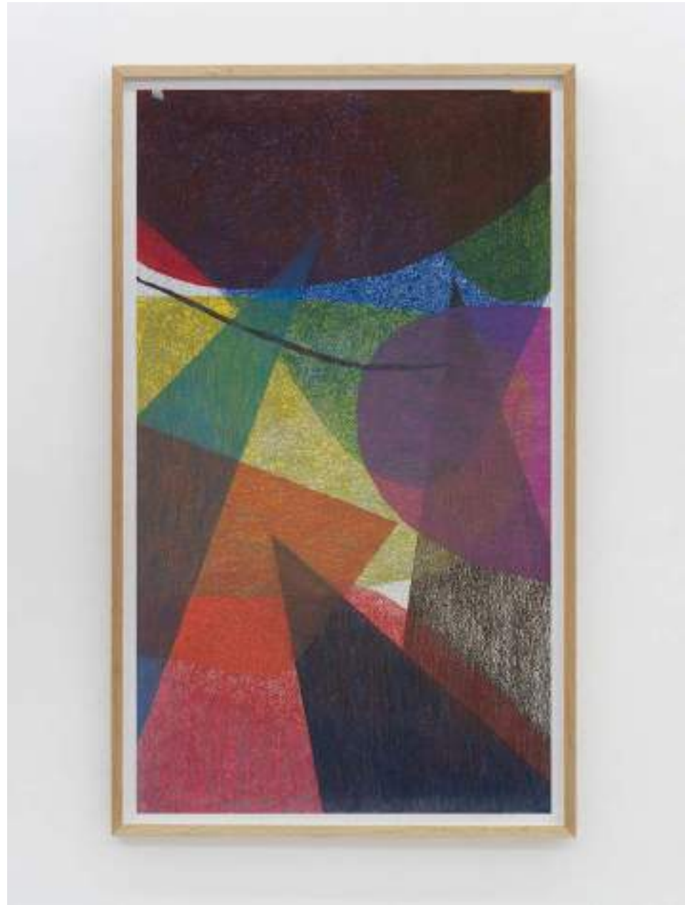
NF/ Daniela Libertad Paisaje 27 2020 Color pencil on paper 122 x 70 cm