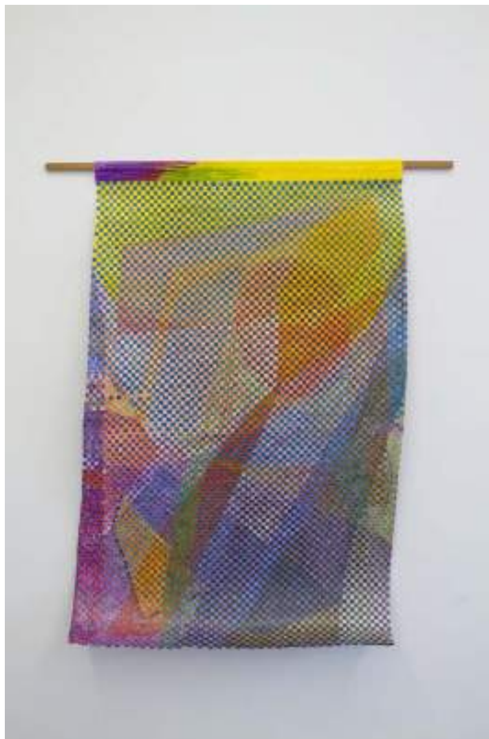
NF / Daniela Libertad Dibujo tejido 10 [side A] 2021 Color pencil on paper 123 x 80 cm