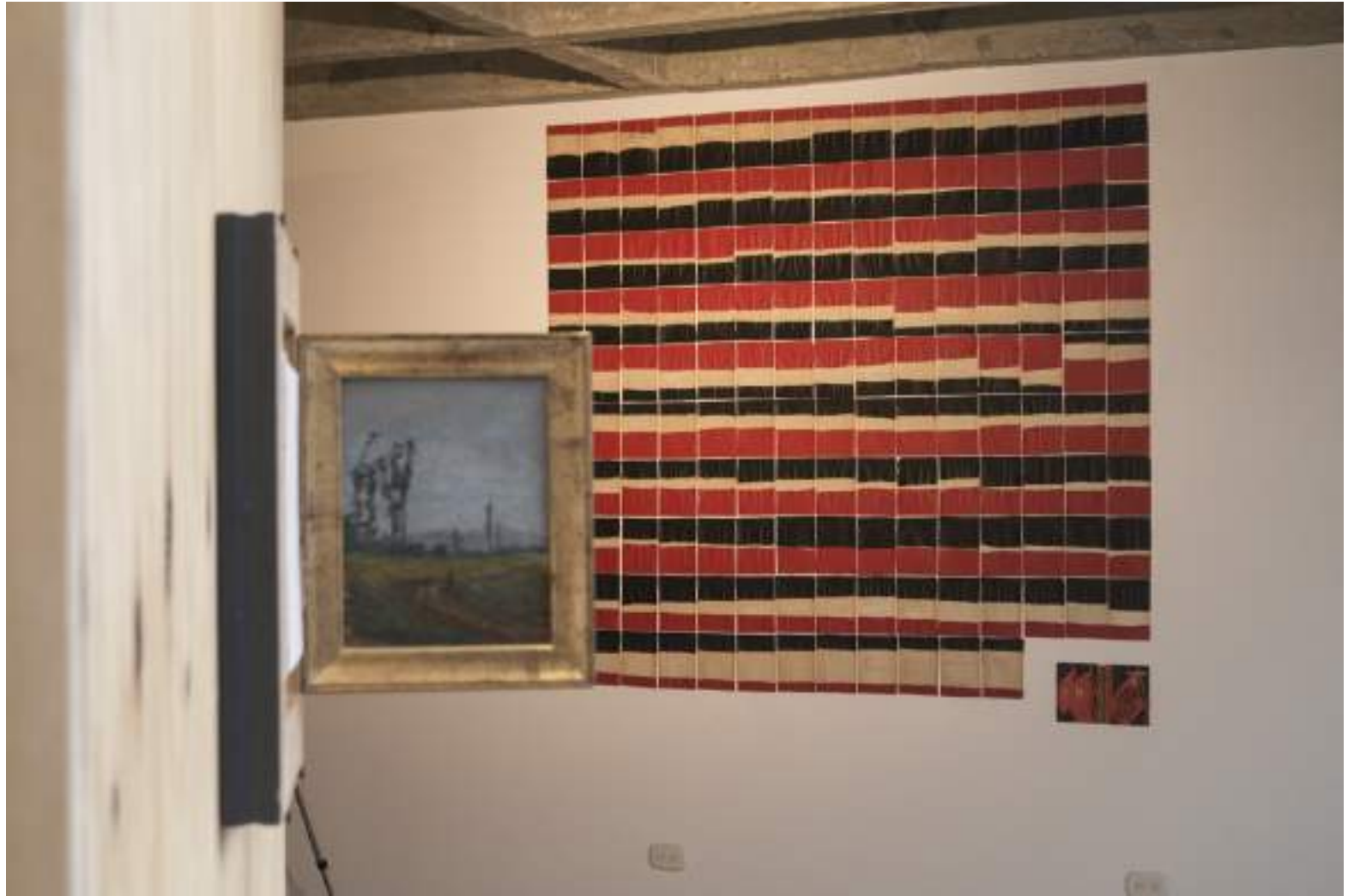
NF/ GOMEZ en Honda Tolima FLORA ars+natura, Bogota Installation view