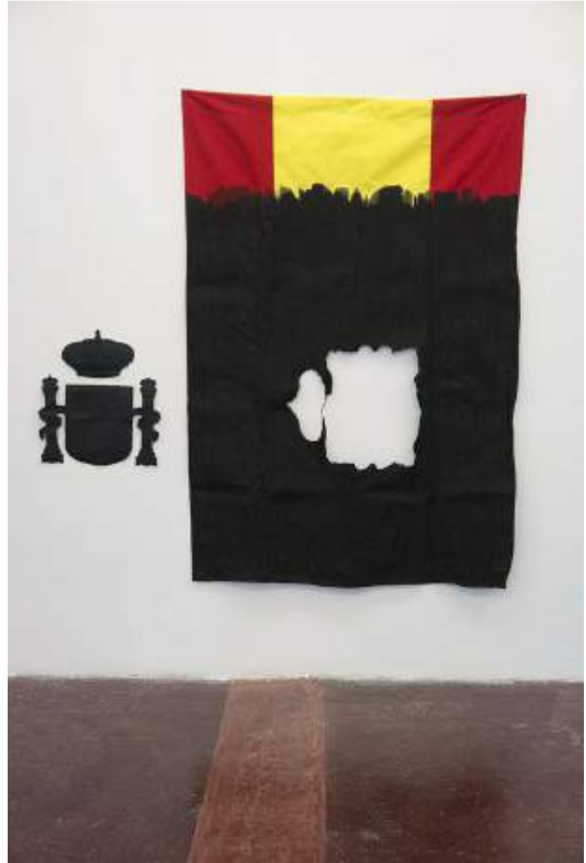
NF / Bandera de España 2018 Black acrylic on cloth and synthetic black enamel on embroidered emblem 150 x 120 cm / 59.10 x 47.24 in