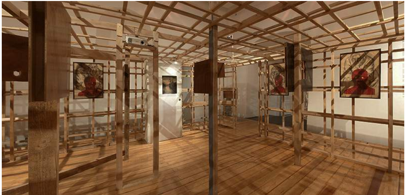
NF / Paraisos artificiales Museo Ex Teresa Arte Actual, INBA, Mexico City. Installation view