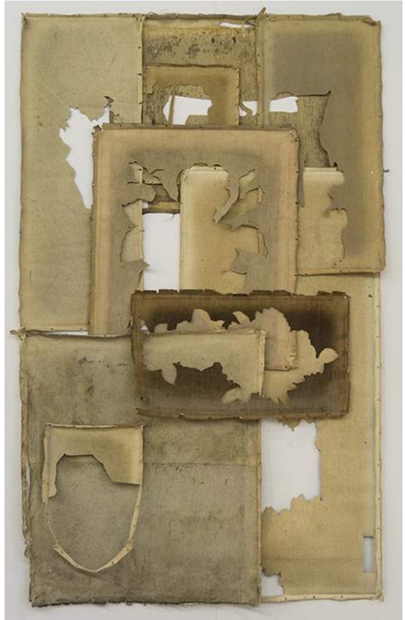
NF / Reverse 2015 Fragments, oil on canvas (1940-1970) 160 x 120 cm / 62.99 x 47.24 in