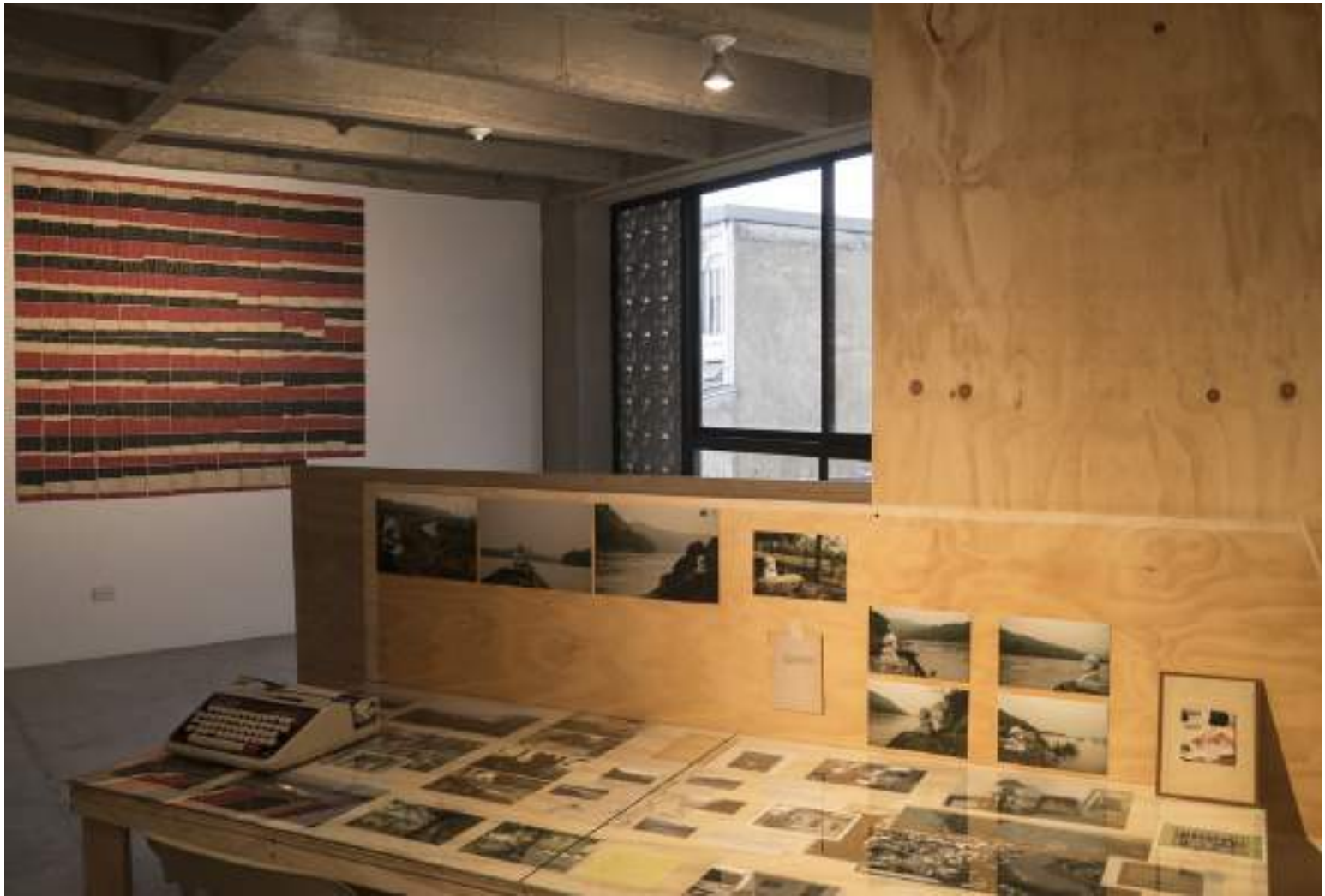
NF/ GOMEZ en Honda Tolima FLORA ars+natura, Bogota Installation view